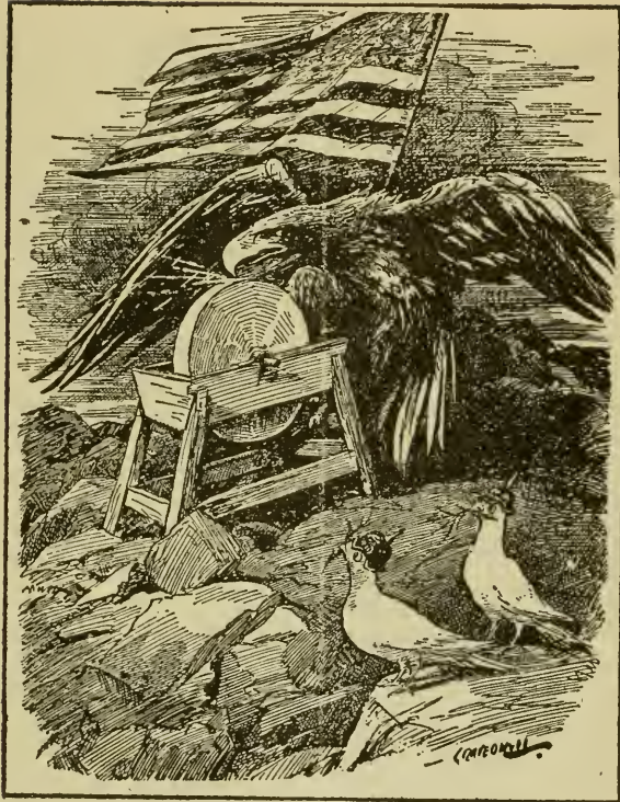
— THE INTRUDERS! AMERICAN EAGLE (to German Peace Doves)—“Go away, I’m busy!” —Punch (London).

This picture was clipped from “ Punch ,” (London) and there is no mistaking it but what the world is in tune with God’s Holy Word.