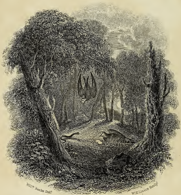
THE NIGHT HAWK.