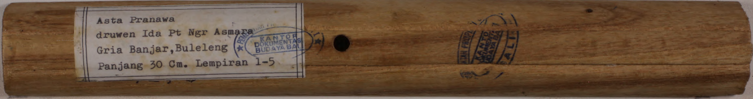
ASTA PRANAWA Pusat Dokumentasi Dinas Kebudayaan Provinsi Bali