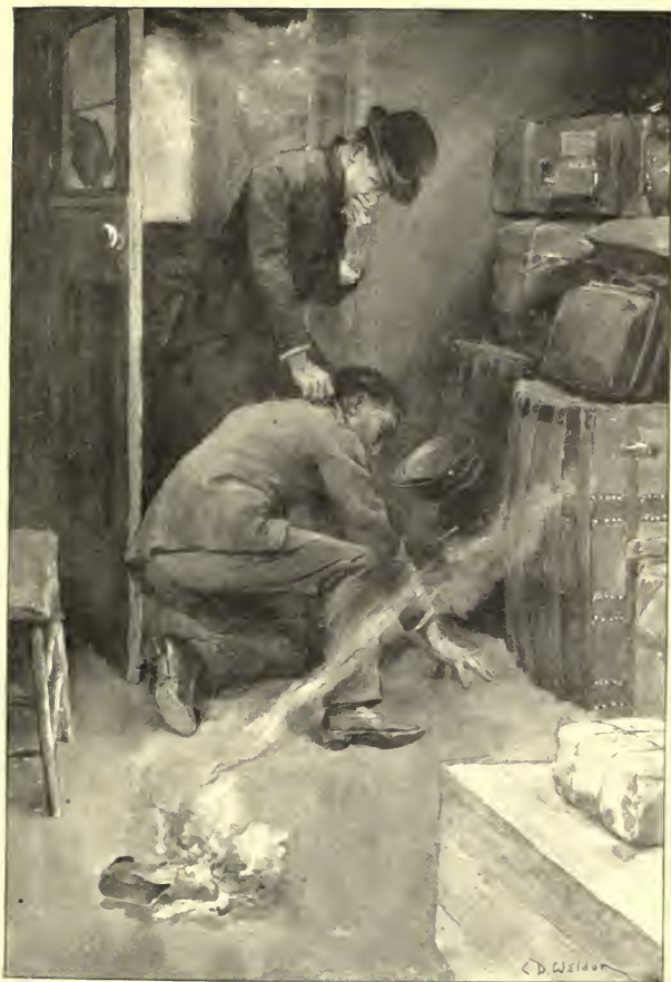
THESE GAVE IT A BETTER HOLD