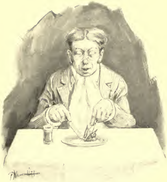
HE EATS A BUTTERFLY