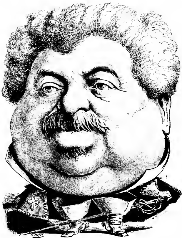
ALEXANDRE DUMAS—THE GIANT