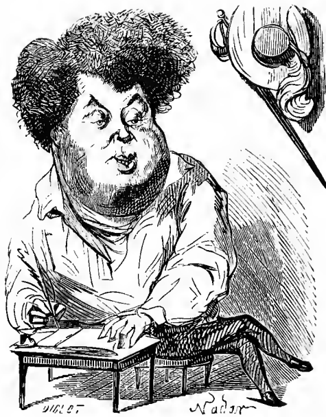
ALEXANDRE DUMAS FROM A CARICATURE BY NADAR.