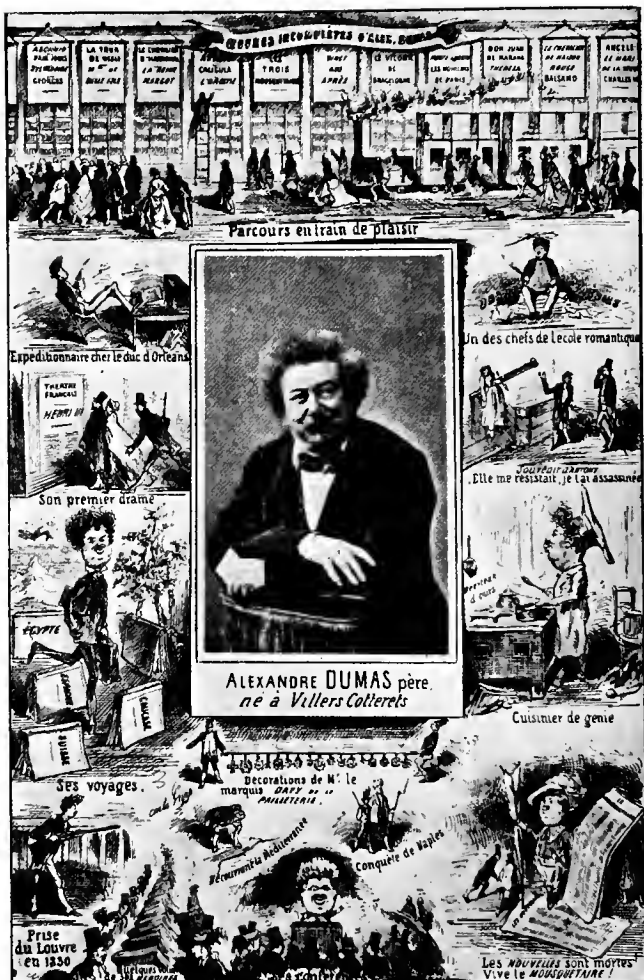
ALEXANDRE DUMAS FROM A DRAWING BY CARLO GRIPP.