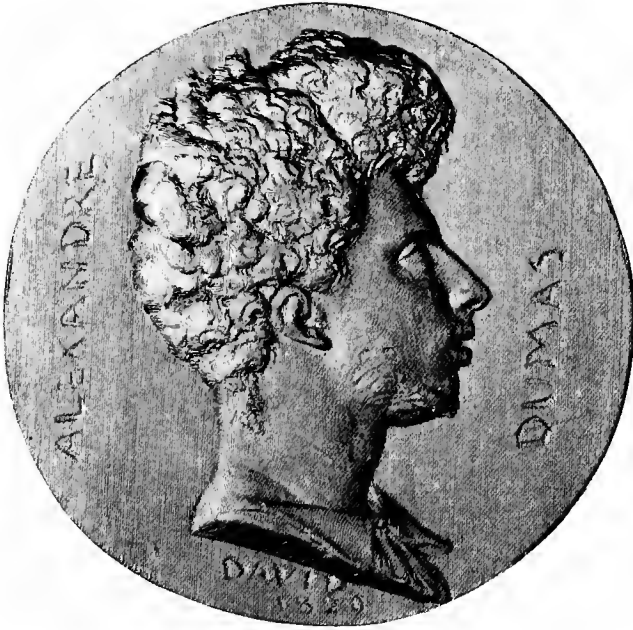
MEDALLION OF ALEXANDRE DUMAS AT THE AGE OF 27 YEARS BY DAVID, OF ANGERS.