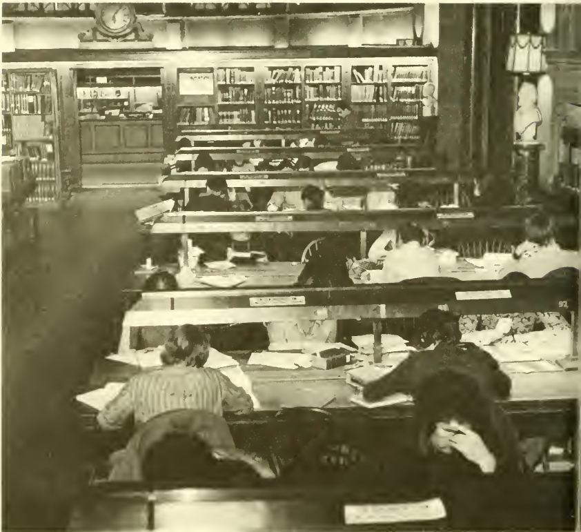
Bates Hall, the main reference room in the Research Library.

The recent increase in staff levels might make it possible for the Print and Rare Book Departments, both closed on the weekends, to be open on Saturdays. (The Rare Book Department was open on Saturdays until 1972; the Print Department has not been open on weekends for at least the past twenty years.)