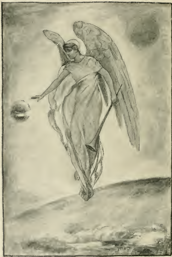
"HE MADE THE STARS ALSO."