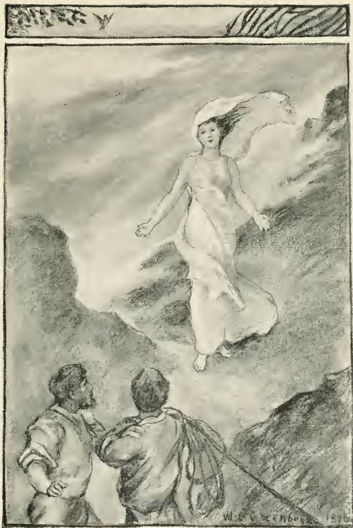
“POURING FORTH HER VOICE IN THAT EXQUISITE SONG.”