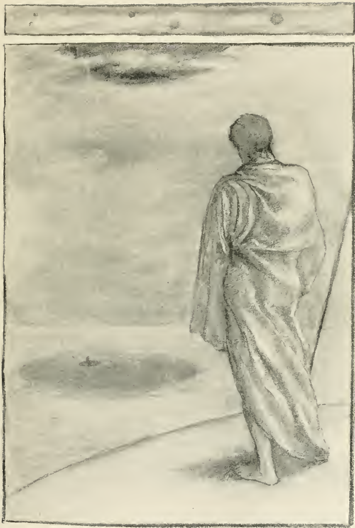
THORWALD DISCOVERS ONE OF THE EARTH-DWELLERS.