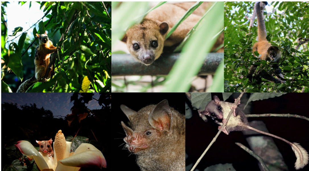
Figure 1. Frugivory and/or nectarivory has evolved repeatedly in mammalian evolution. Images are examples of frugivorous/nectarivorous species across six orders of mammals: (top left) Rodentia, variegated squirrel ( Sciurus variegatoides ), image by Amanda Melin; (top middle) Carnivora, kinkajou ( Potus flavos ), image by Kids Saving the Rainforest; (top right) Primates, Geoffroy's spider monkey ( Ateles geoffroyi ), image by Amanda Melin; (lower left) Didelphimorphia, woolly opossum ( Caluromus derbianus ), image by Christian Ziegler, reproduced with permission; (lower middle) Chiroptera, a Seba's short-tailed bat ( Carollia perspicillata ), image by Roberto Leonan Morim Novaes, reproduced with permission; (lower right) Scandentia, a pen-tailed treeshrew ( Ptilocercus lowii ), image shared with permission by Annette Zitzmann.

This lowers the K_m —i.e. increases the enzyme affinity—for small alcohols like ethanol, while simultaneously disfavoring larger alcohols such as geraniol. Secondly, we predict that the ADH7 genes of highly insectivorous, carnivorous or herbivorous species, which are less likely to be exposed to dietary ethanol, are pseudogenized through frameshift or mutations leading to premature stop codons due to relaxed selection. To test these predictions, we examined ADH7 gene sequences of multiple groups of mammalian species including treeshrews, rodents, leaf-nosed bats and marsupials to study variation at site 294 and potential pseudogenes. Furthermore, we ran phylogenetic generalized linear models to test for statistically significant effects of frugivorous and/or nectarivorous diets on (i) variation at site 294 and/or (ii) putative ADH7 gene functionality versus pseudogenization. Our research expands on data generated by recent study [15] by including ADH7 sequences for an additional 89 ecologically relevant species, of which 59 are newly sequenced in this study, allowing us to better test adaptive hypotheses while controlling for phylogenetic effects.