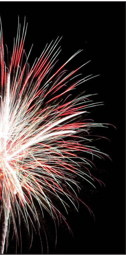
...k display over the bay is ...rks are purchased from New ...do Special Effects set up and ...O display has much larger ...s because it is shot over water.