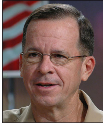
CNO Adm. Mike Mullen

is because we're afraid to talk about the subject. We don't know how to talk about it. We've got to get over that.