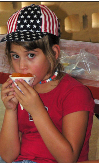
...na Borema enjoy snow ...pendence Day Carnival.