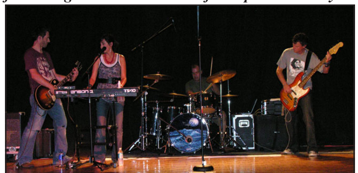
Pop rock — The pop rock band, JagStar, performs at the Windjammer Ballroom July 2.