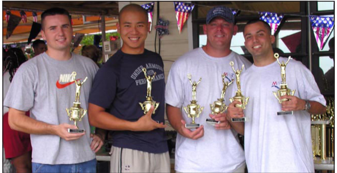
Dodgeball — Members of the 'Covert Crabs' dodgeball team show off their first place trophies, awarded at the Independence Day carnival at the Sailing Center.