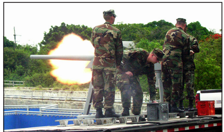
Gun salute — Alternating 40-mm saluting batteries, members of the NAVSTA Weapons Dept. fire a 21-gun salute in honor of Independence Day.