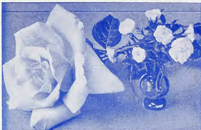
Countess Vandal is contrasted with blooms of the white miniature gem, Pixie, shown in a 1½" high vase.