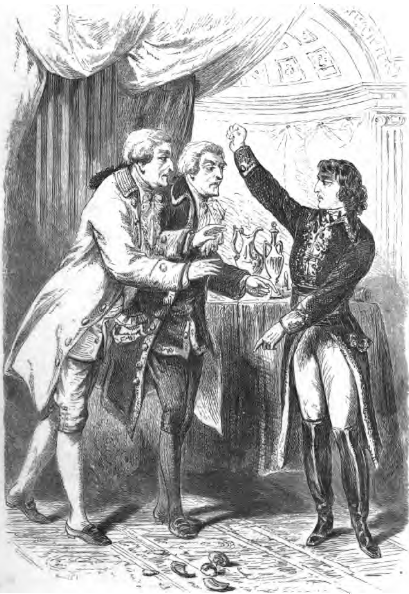
NAPOLEON AND COUNT COBENZL.