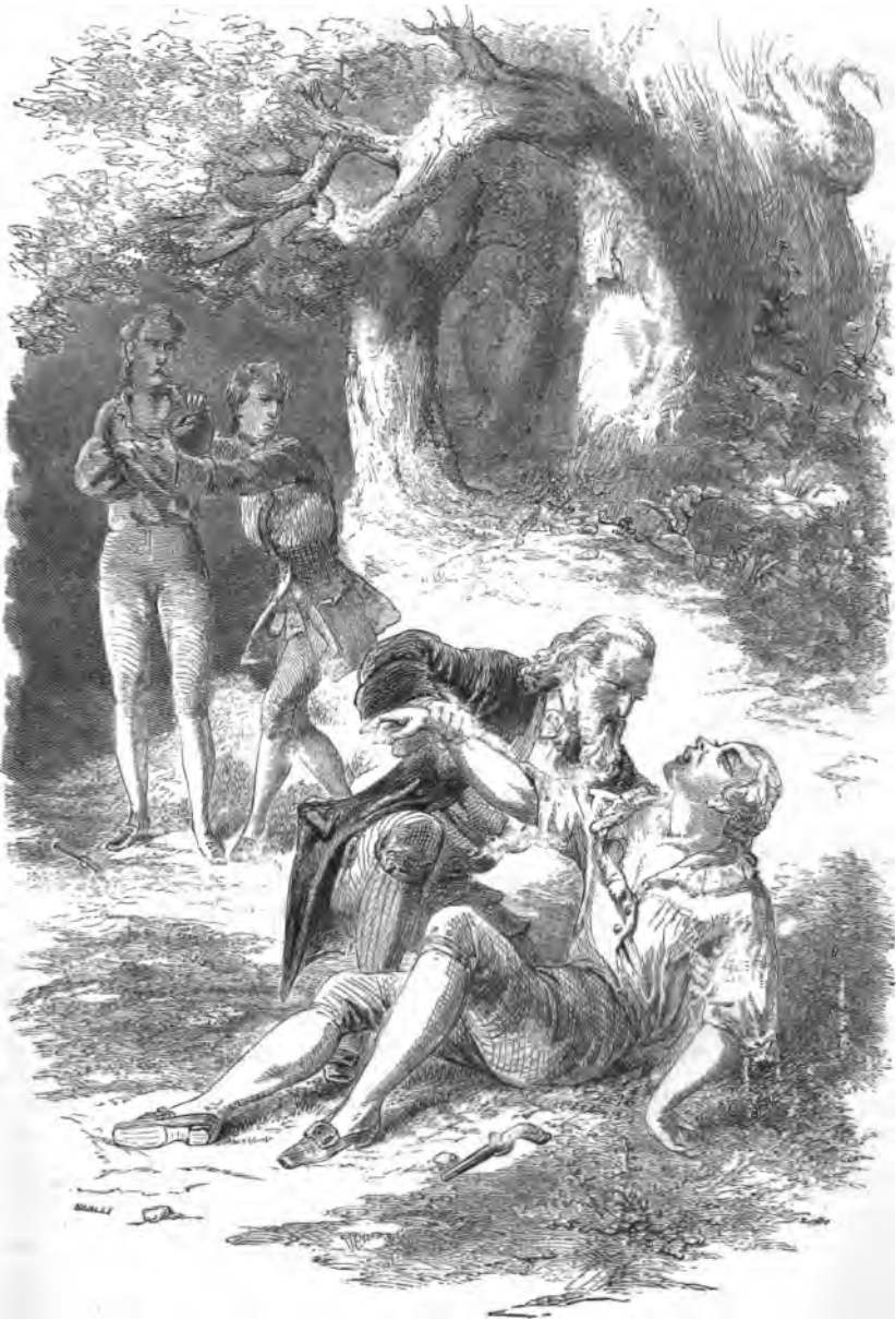
THE DUEL. DEATH OF PRINCE LIOTENSTEIN.