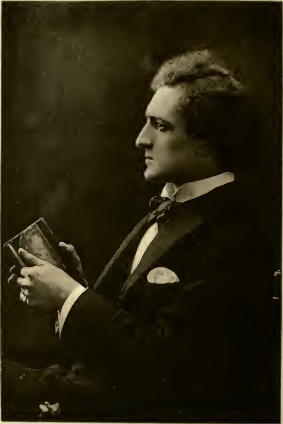
Richard Le Gallienne