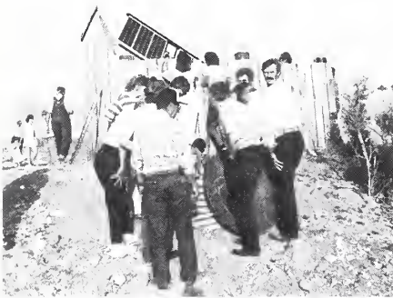
Above, tour group at collection well of solar pump on Careless Creek Ranch near Hedgesville, Mont. Solar panel can be seen above the fenced enclosure. At right, plastic-lined pit can hold 77,000 gallons of pumped water.

Adapted from an article in the August 4, 1988, edition of the Times-Clarion , Harlowton, Mont.