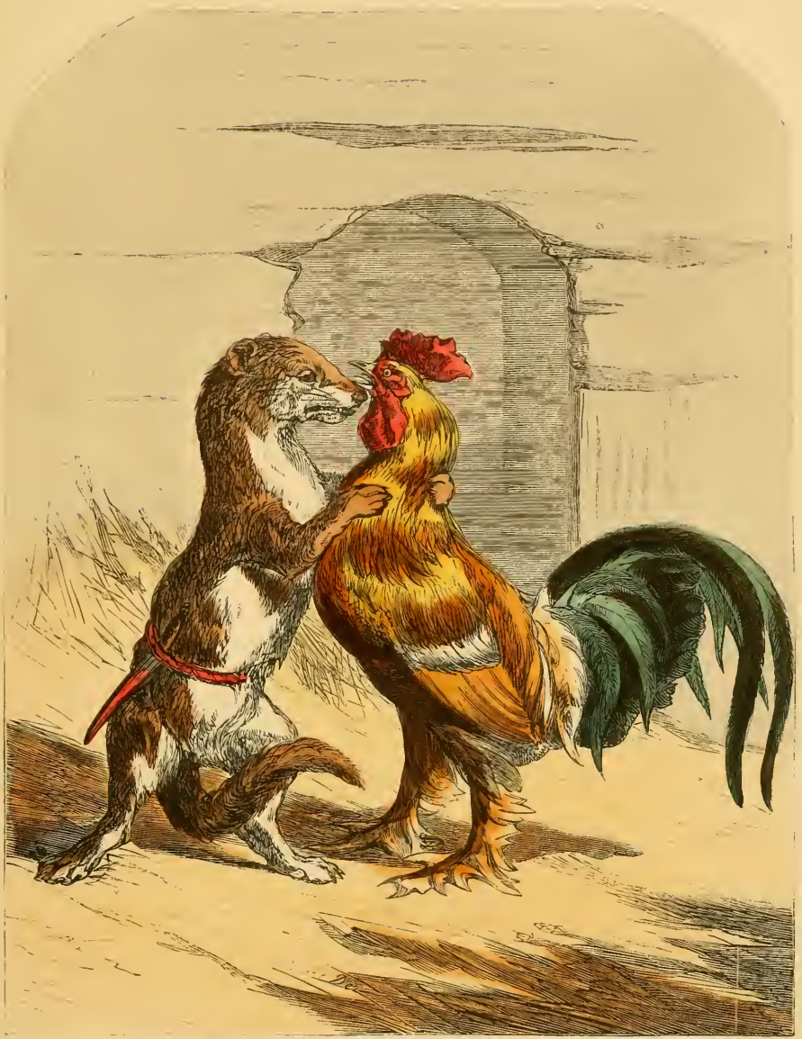
MR. BANTAM'S INTERVIEW WITH OLD MARTEN.