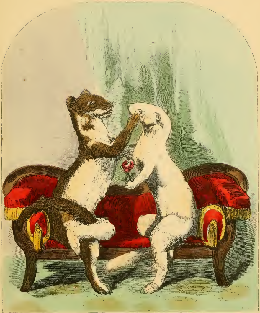
THE VERY ATTENTIVE PHYSICIAN.