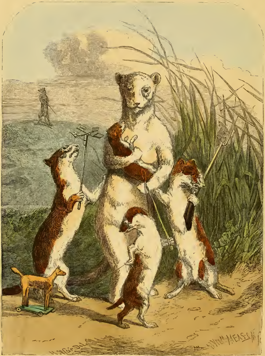
DAME WEASEL AND HER CHILDREN.