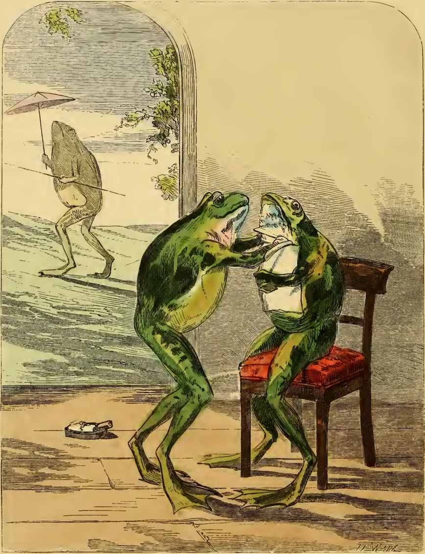
THE FROGS WHO WOULD A-WOING GO.