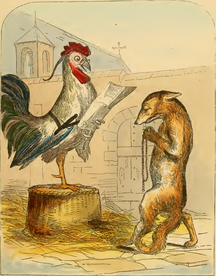
REYNARD IN THE LIKENESS OF A HERMIT.