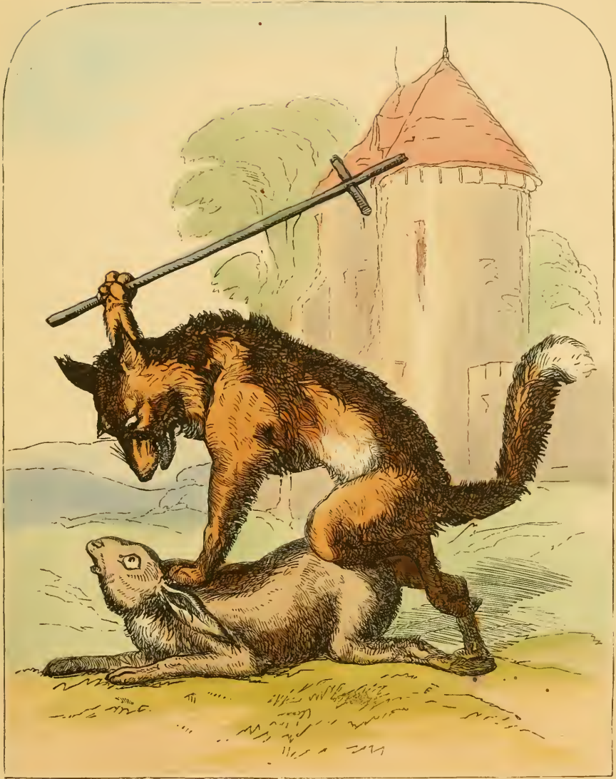
REYNARD ATTACKETH LAPRELL THE RABBIT.