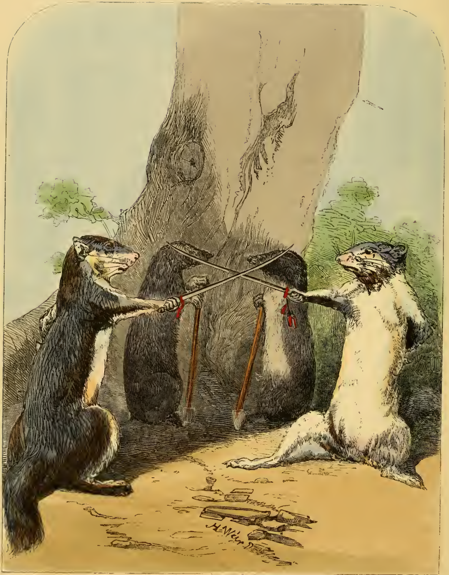
THE DUEL OF THE DORMICE.