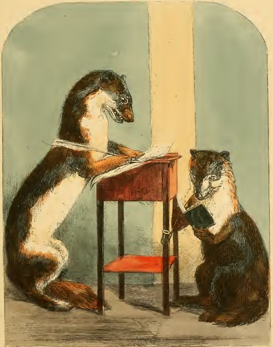
OLD MARTEN AND SHARP WEASEL, ESQ.