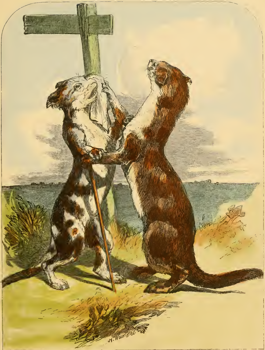
YOUNG MARTEN BIDDING FAREWELL TO MISS PAULINA.