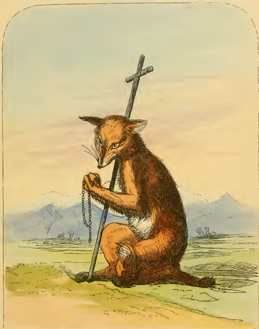
REYNARD ON HIS PILGRIMAGE TO ROME.