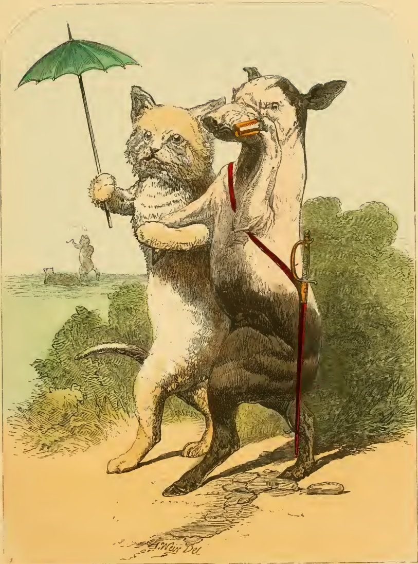
ENSIGN SQUEAKER AND MISS ROSE.