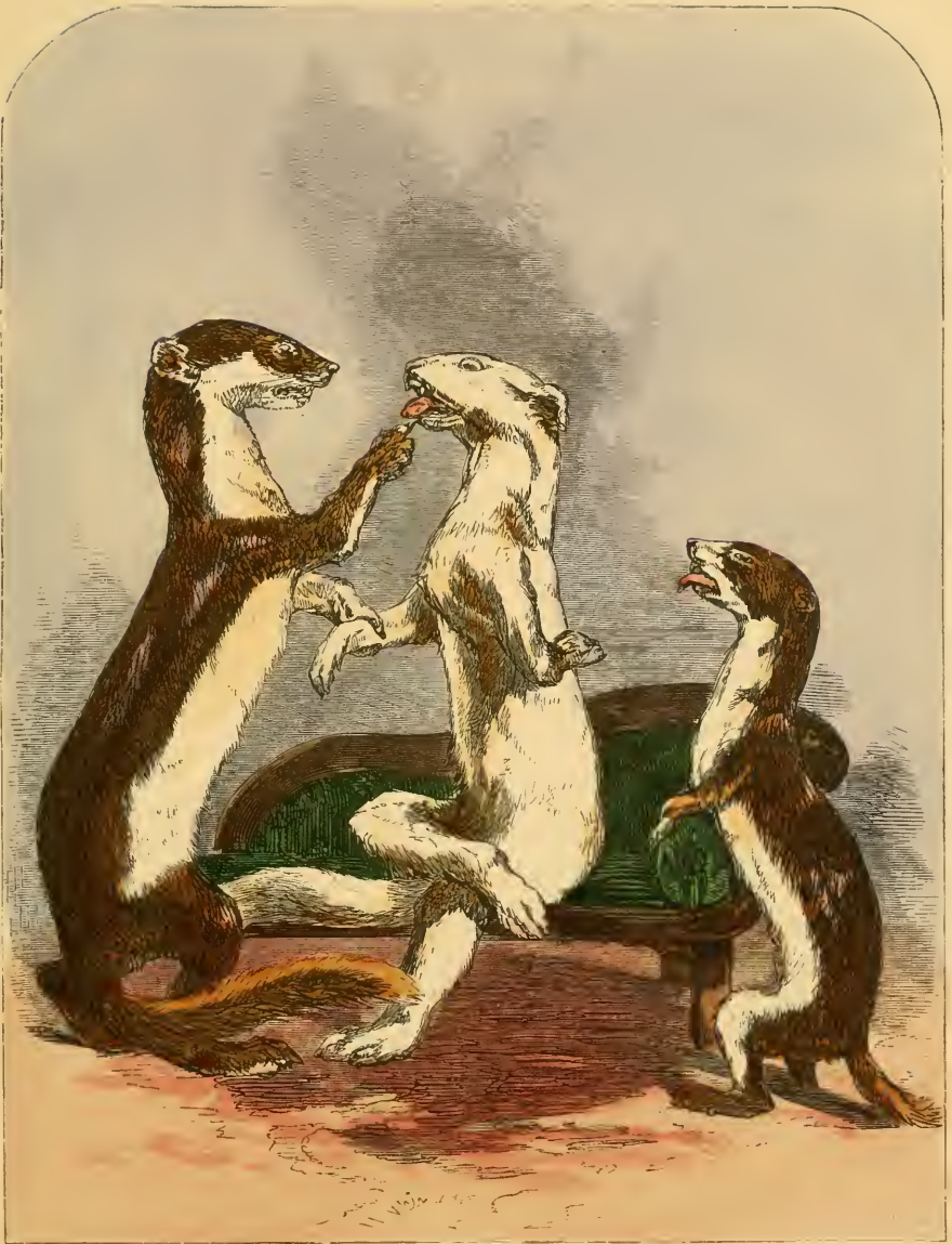
THE ATTENTIVE PHYSICIAN.