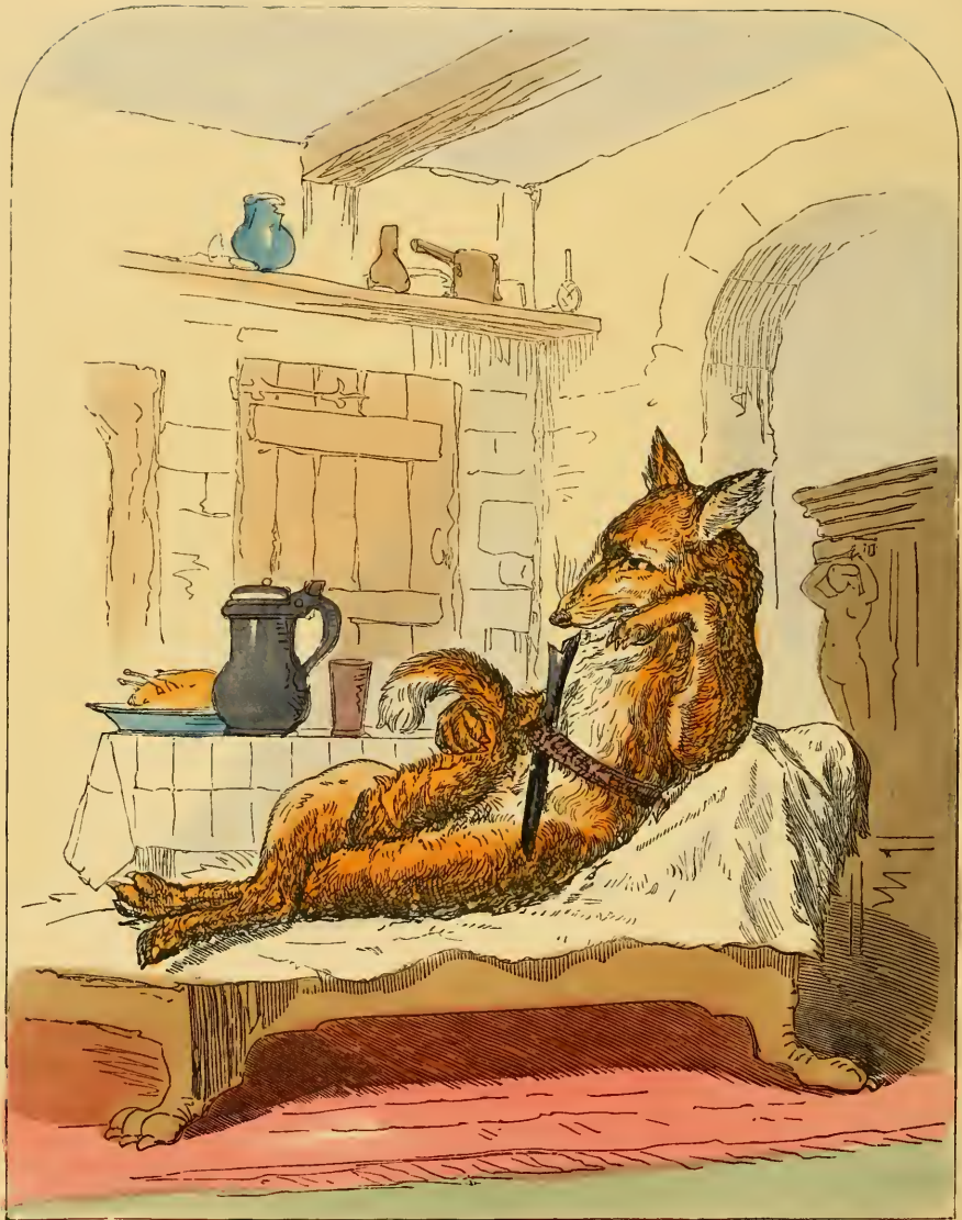
REYNARD AT HOME AT MALEPARDUS.