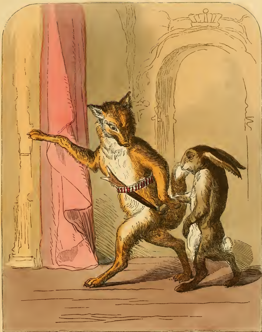
REYNARD BRINGS FORWARD THE HARE AS HIS WITNESS.