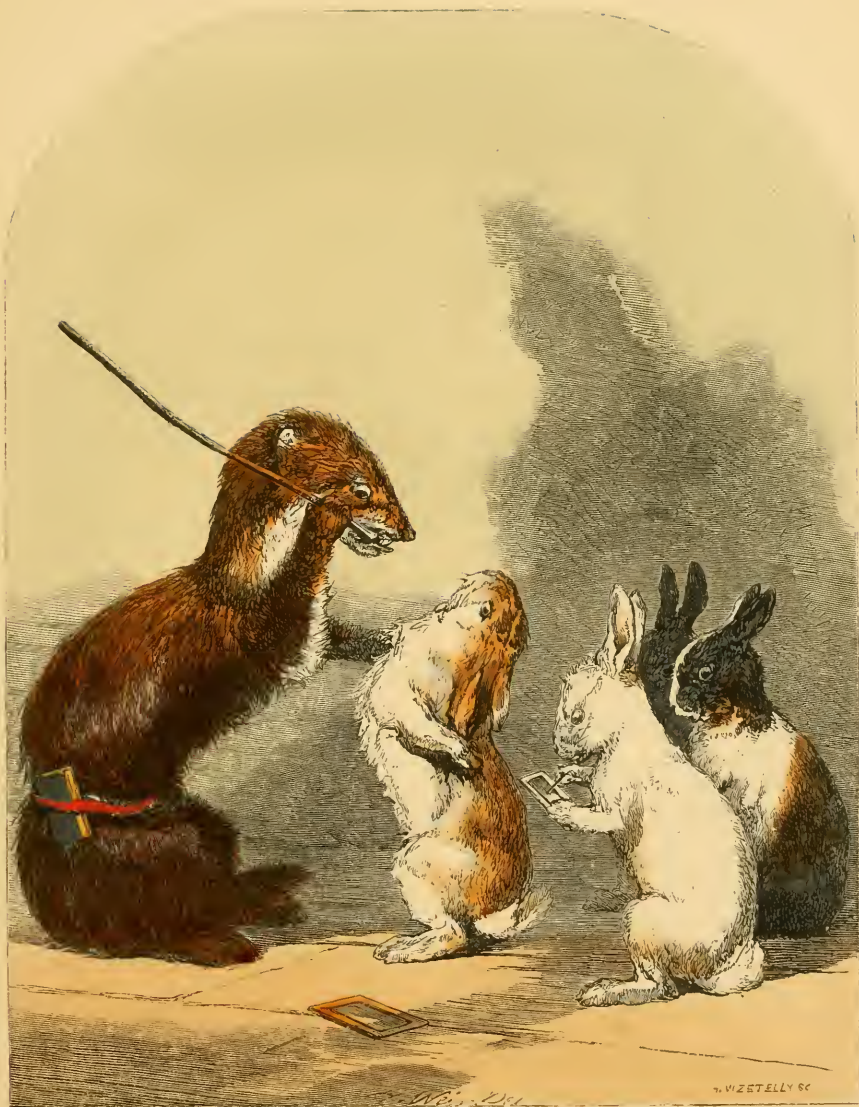
LONGTAIL TEACHING THE YOUNG RABBITS ARITHMETIC.