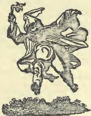
Alter et Idem.