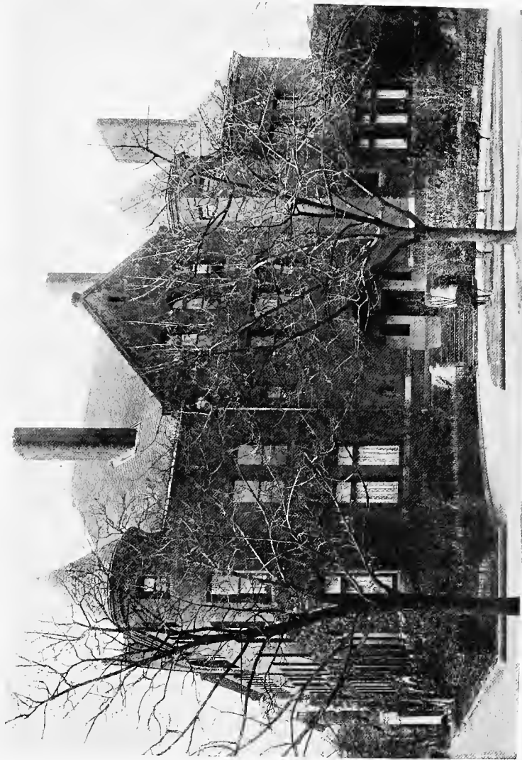
JOHN HAY'S WASHINGTON HOUSE