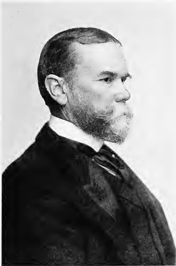
in 1897