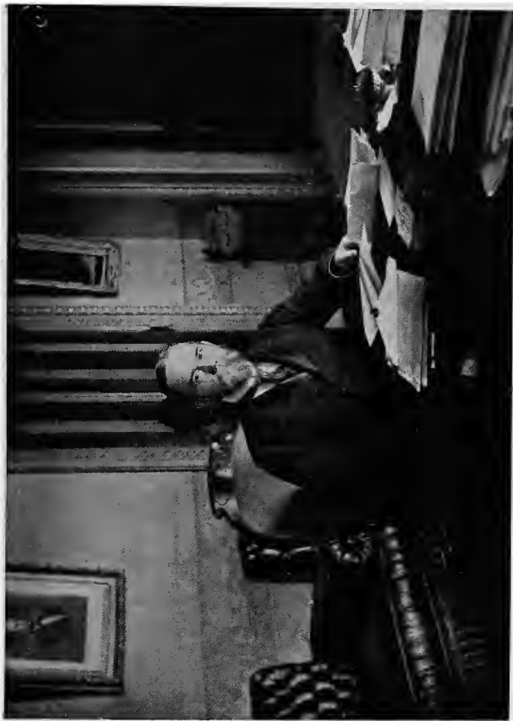
SECRETARY HAY IN HIS OFFICE IN THE STATE DEPARTMENT