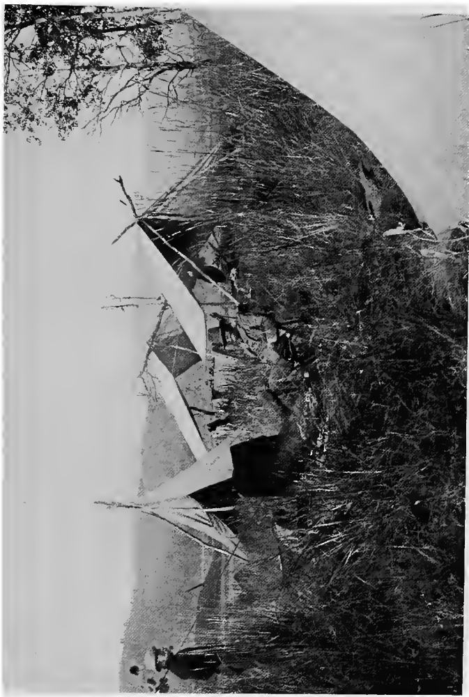
JOHN HAY AND HENRY ADAMS CAMPING IN YELLOWSTONE PARK, 1894