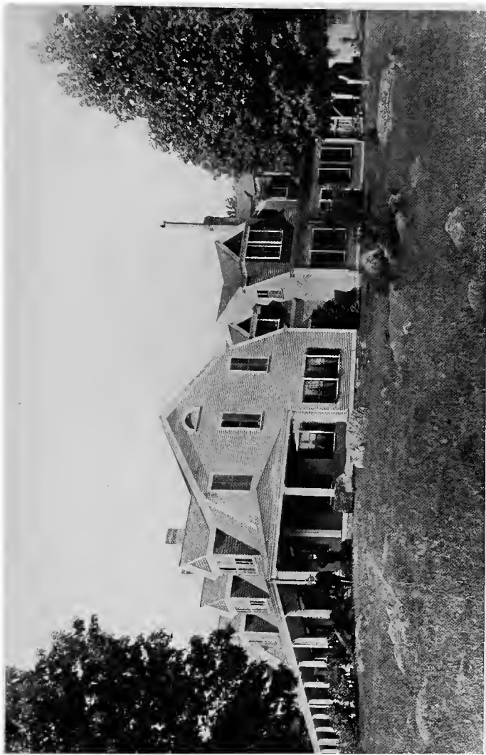
JOHN HAY'S SUMMER HOME, "THE FELLS," AT NEWBURY, ON LAKE SUNAPEE NEW HAMPSHIRE