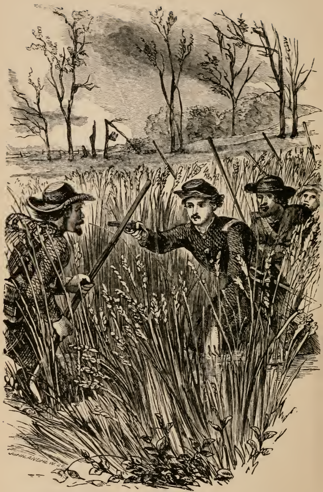
Lieutenant Somers and the Rebel Pickets. Page 70.