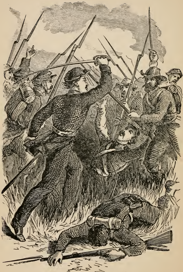
Lieutenant Somers at Glendale. Page 199.