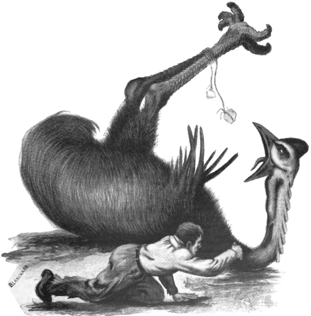
"As soon as he went down, I was out of the water and sawing at his neck with my knife"

"Winslow was telling me as much," said the man with the scar. "If they get any more Æpyornises, he reckons some scientific swell will go and burst a blood-vessel. But it was a queer thing to happen to a man; wasn't it—altogether?"