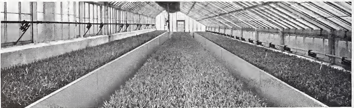
Carnation Cuttings in the Sand

Note the cement benches—both side and upper ventilation, and top curtain to shut off direct draft.