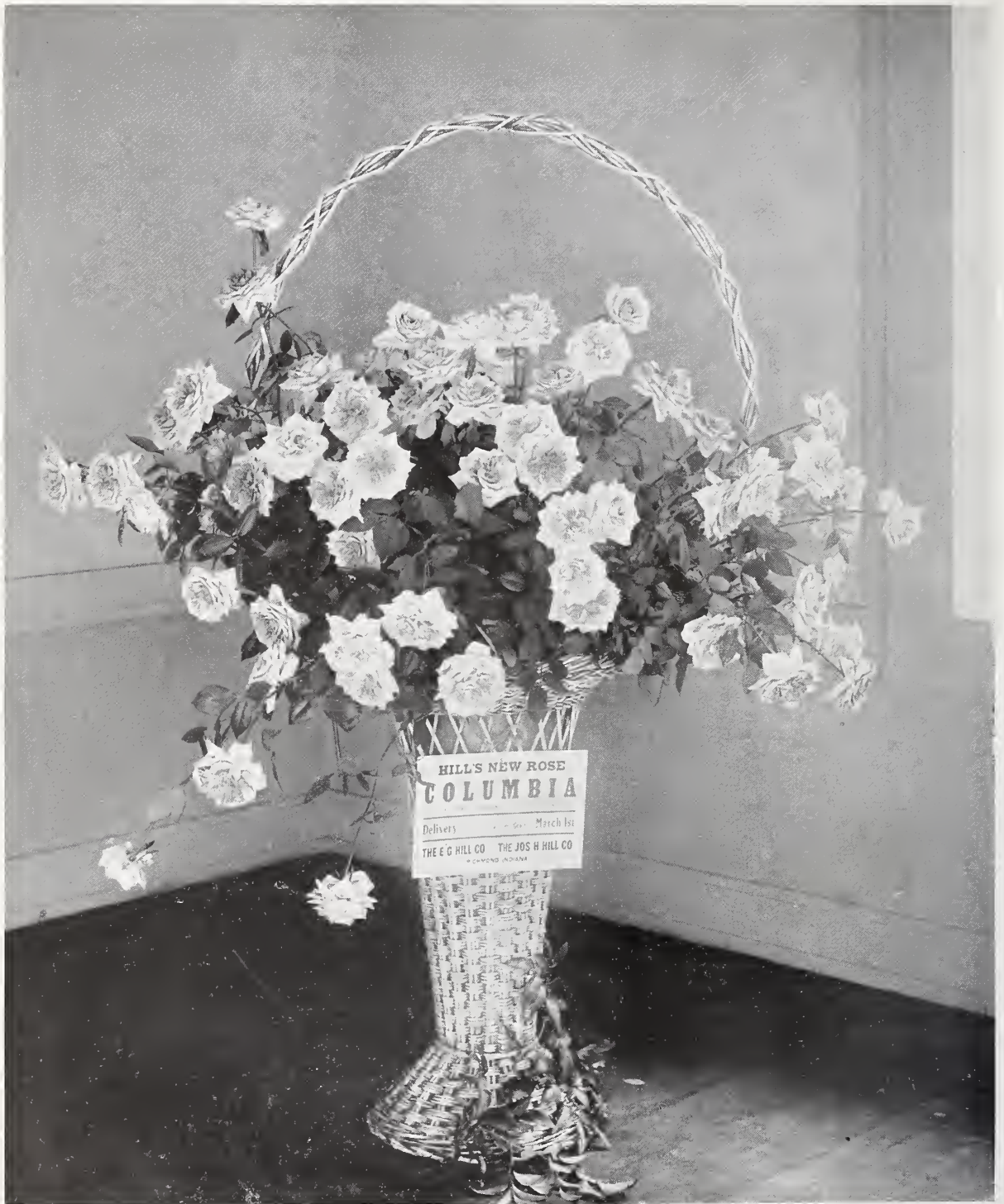
Basket of COLUMBIA shown at the F. T. D. Meeting in Detroit in September, 1917.