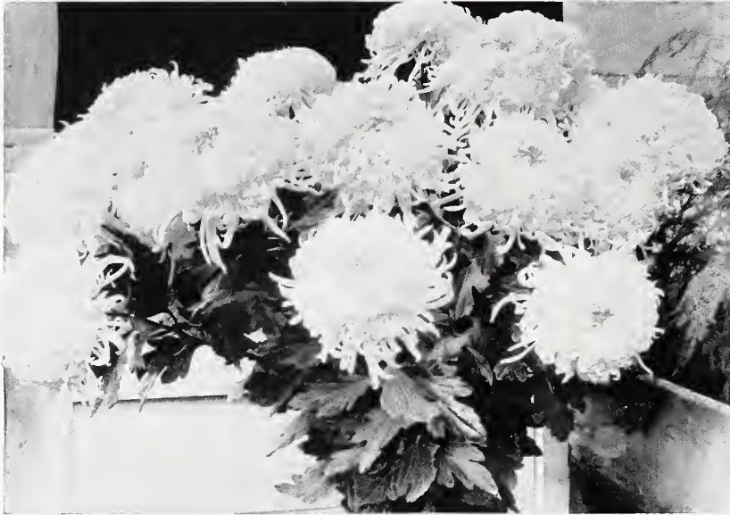
Hamburg Late White