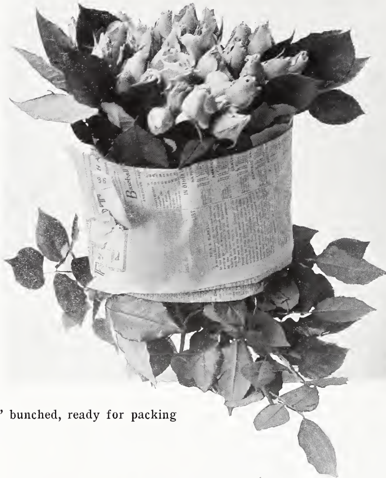
"Corsage Buds" bunched, ready for packing