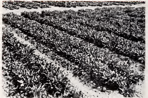
BB201 – Black & white electrotype, price each . . . . $2.00

Electrotypes of black and white cuts and full color nickeltypes are available in the sizes shown on this page. Order by number on the order card enclosed.