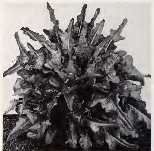
BB101 – Black & white electrotype, price each . . . . . $2.50