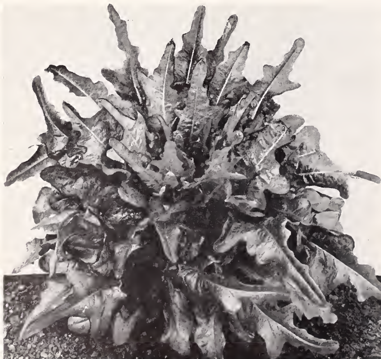
BB301 – Black & white electrotype, price each . . . . . $3.25