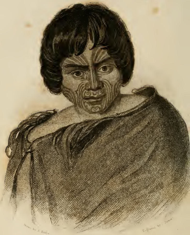
Aranghiu: The Tattooed of New Zealand.