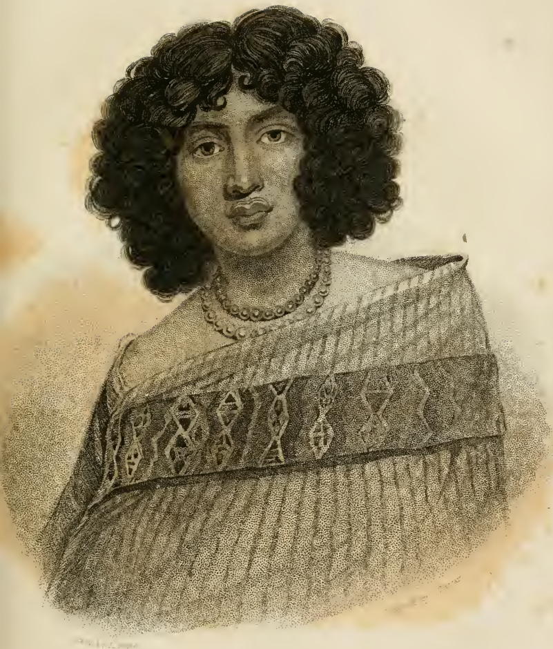
A. New Zealand Girls