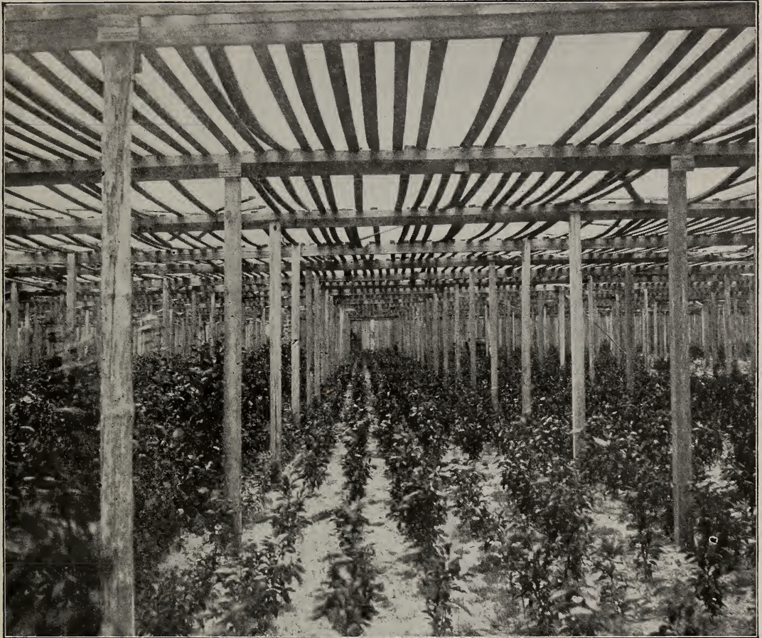
Propagating Sheds for Seedlings

it can be done two or three weeks before tree is set out, and even then should be thoroughly mixed with the soil as all commercial fertilizers are highly concentrated and liable to burn the young rootlets if they come in direct contact with them. We prefer to wait two or three weeks, then apply on the surface about one pound of high-grade special orange tree manure, well raked in. In the thin, sandy soils of Florida we believe an orange tree will stand much more fertilizer than it generally gets. We believe beginning, say in March, one pound every month or six weeks can be applied to great advantage provided there is but little or, better still practically no organic matter in the manure, as too much of that will cause die back. These applications as above can be kept up till October, when the tree should soon become dormant and take the rest nature has provided for the winter.