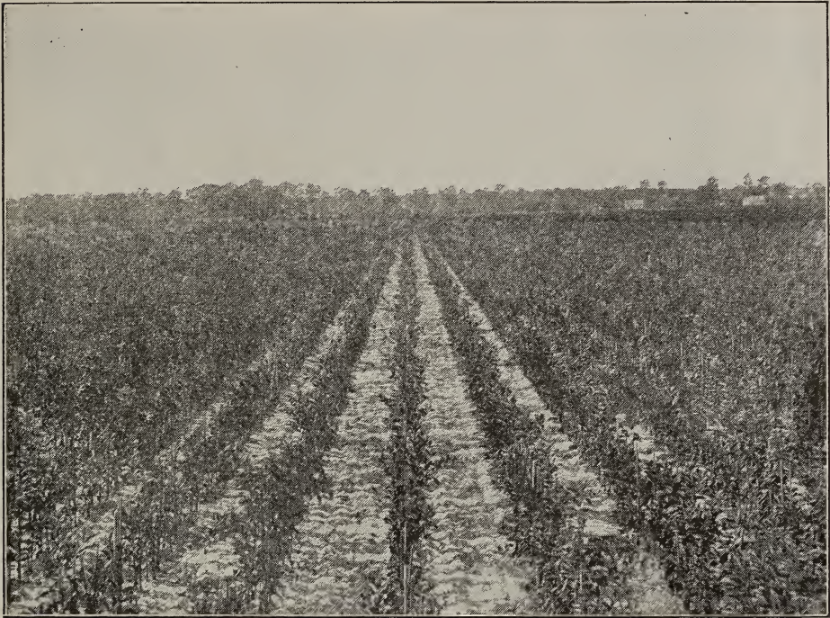
Just a Few More Rows One-Fourth Mile Long

before new roots can start. Some planters argue that they prefer to wait for the rainy season so as to require no water in planting, but the law of compensation is ever at work and you will be repaid many times over for the small expense of watering by the more vigorous condition your tree is in when it starts off in the spring. We, therefore, advise by all means plant if you can while the tree is yet dormant in nursery, November, December, January and you make no mistake. After our trees start to grow and are full of new growth and sap is in our opinion the very worst time to plant, though there is a time if carefully watched when the first growth is hardening up when the tree is semi-dormant, but we prefer to go on record as being opposed to unseasonable planting.