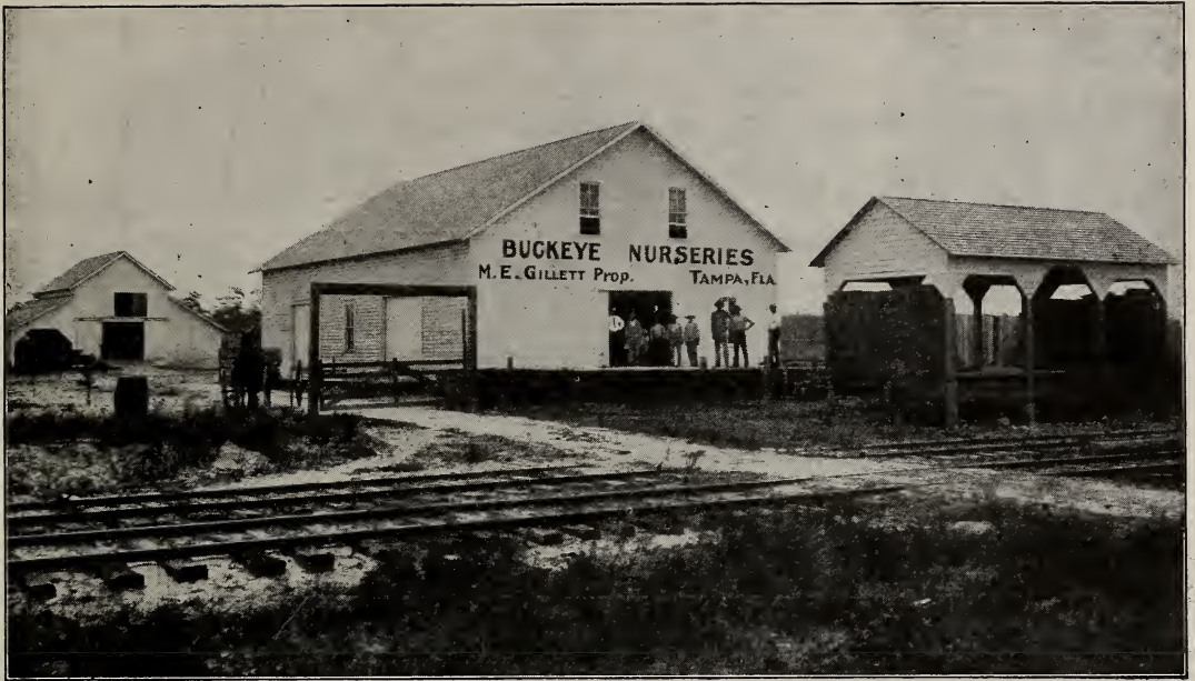
Packing House and Siding