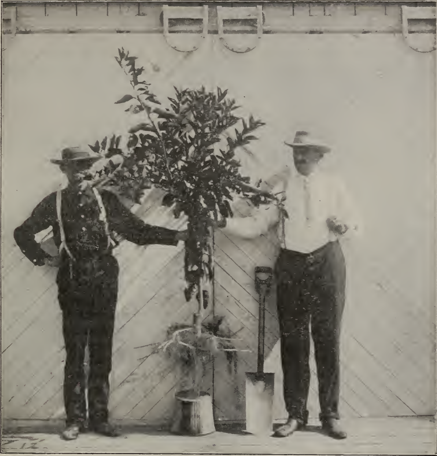
One Year Bud Branched at Three Feet