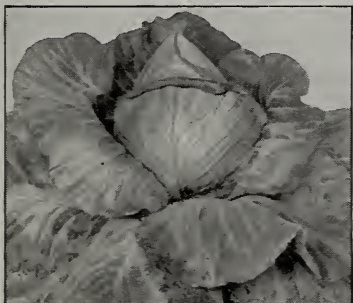
Early Jersey Wakefield Cabbage