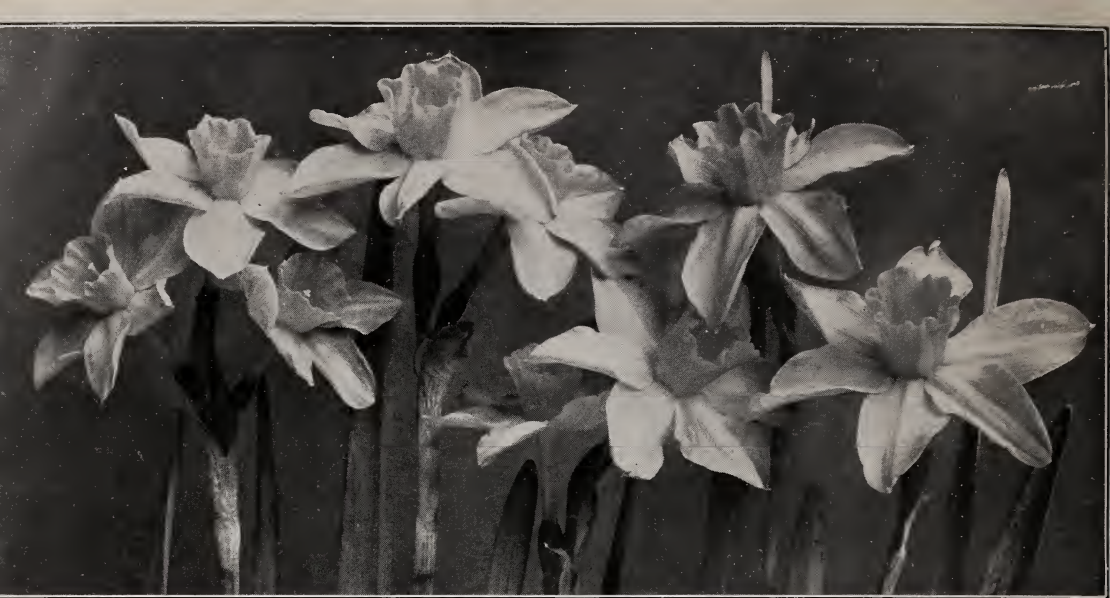
Sir Watkin Narcissus