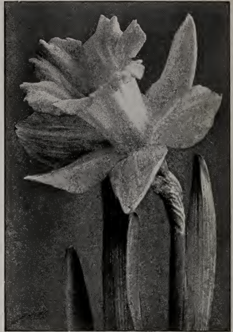
French Golden Spur Narcissus

L. azoricum. Similar to L. Harrissii excepting being longer in the trumpet. $8.50 per doz., $60 per 100.