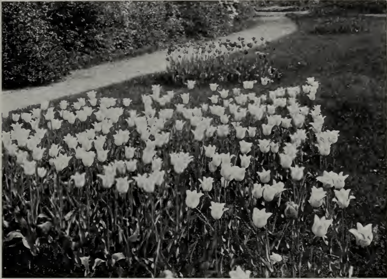
Bed of Picotee Tulips