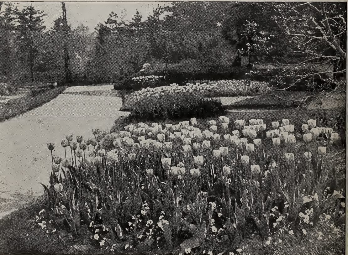
Pride of Haarlem Darwin Tulips

WILLIAM M. HUNT AND COMPANY 148 Chambers Street NEW YORK CITY