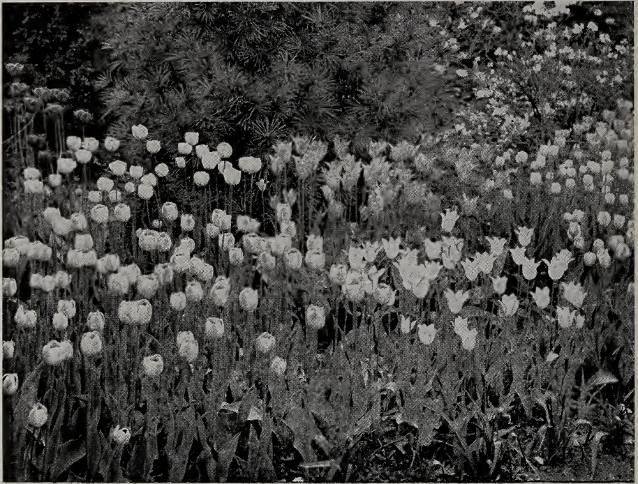
Cottage or May-flowering Tulips