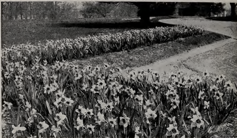
Border of Trumpet Narcissi