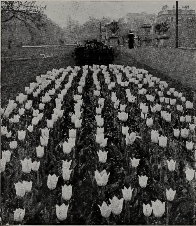
Bed of Single Early Tulips