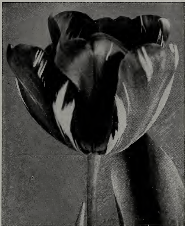
Rembrandt Tulip, Victor Hugo