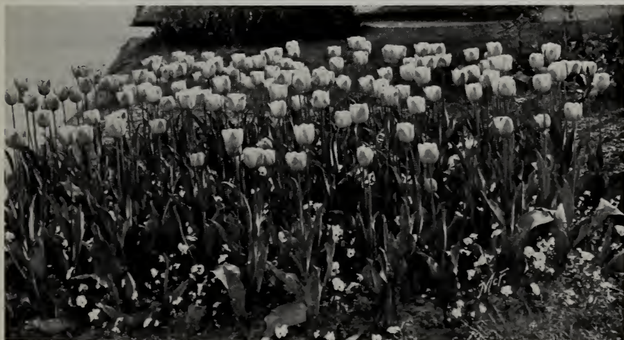
Bed of Darwin Tulips