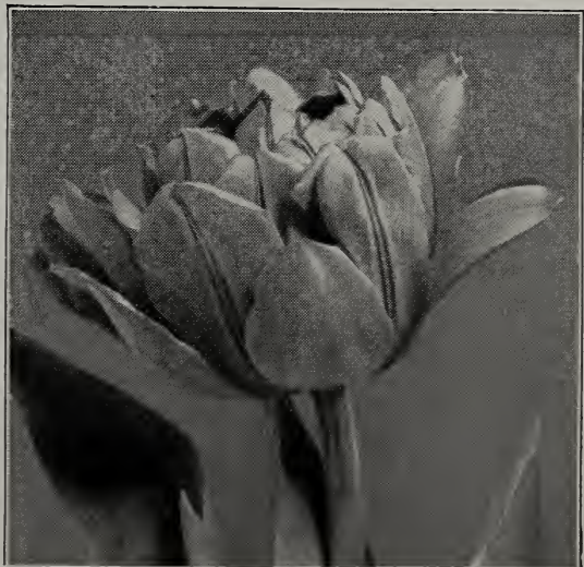
Double Tulip, Couronne d'Or

Siren. (First Class Certificate, R. H. S., London.) A very beautiful flower. The color is rich cerise-pink, with pale pink at the margins of the segments, and a white base. $15 per doz.