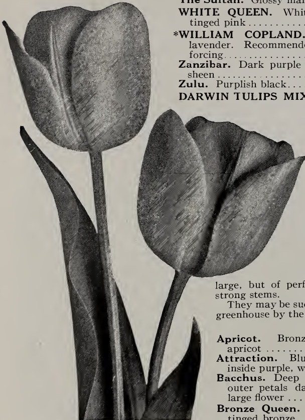
Darwin Tulip, Clara Butt (see page 7)