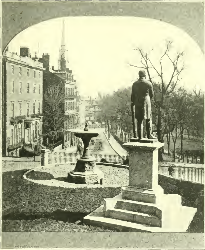
VIEW OF PARK STREET FROM THE STATE HOUSE Showing Ticknor House at left and the Sidewalk with Trees along the Common Side