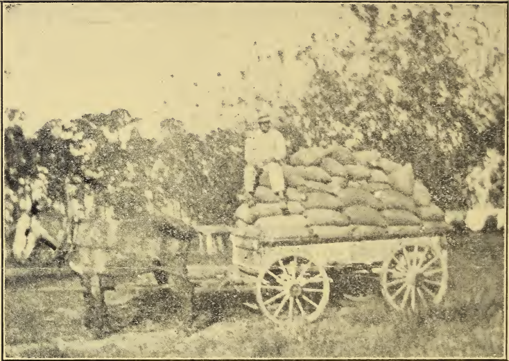
$2,000 LOAD OF PECANS

MEDAL AND DIPLOMA was awarded us at the World's Fair, St. Louis, Missouri.