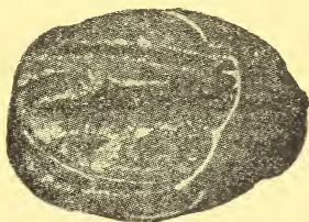
Broken "SUCCESS" Natural Size