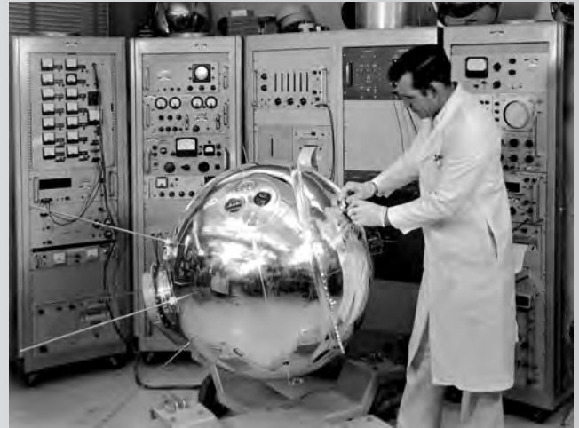
A GSFC scientist examines the atmospheric satellite Explorer XVII prior to launch.

Mail: Code 272 NASA Goddard Space Flight Center Greenbelt, MD 20771 Location: Building 21 Homer E. Newell Memorial Library Hours of operation: Monday through Friday, by appointment 10:00 a.m. to 3:00 p.m. eastern time Telephone: 301-286-7218