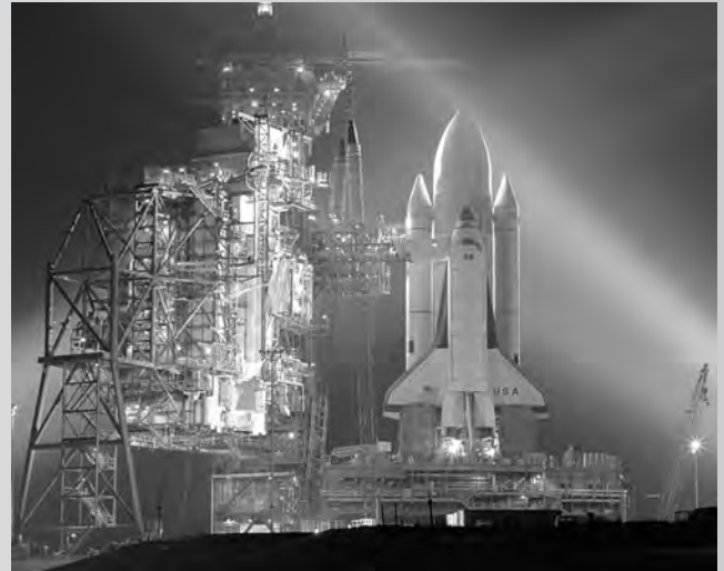
Image of the Space Shuttle Columbia in the hours prior to its 1981 launch on STS-1.