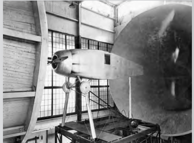
Section of aircraft tested for drag in Langley wind tunnel.