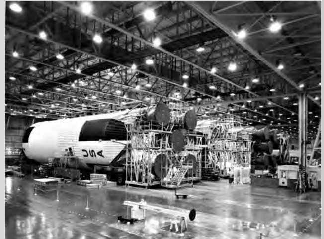
Saturn V rockets being prepared for testing.