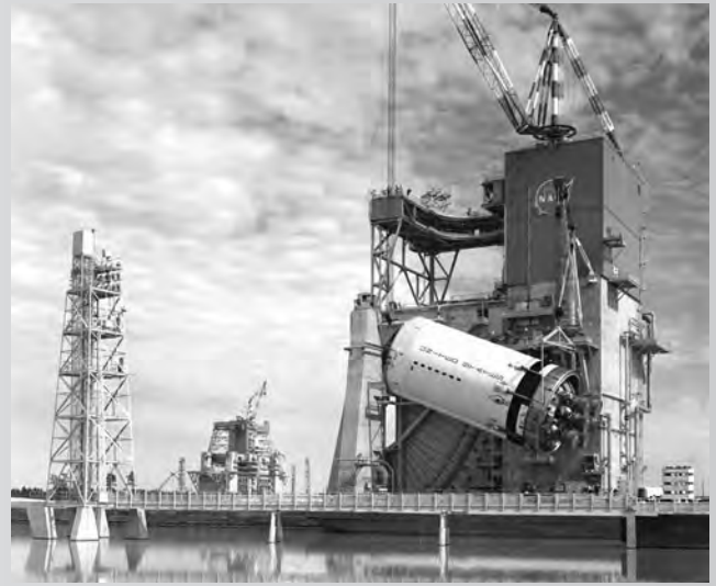
The S-II stage of the Saturn V rocket is hoisted onto the A-2 test stand in 1967 at the Mississippi Test Facility, now Stennis Space Center. This was the second stage of the 364-foot-tall Moon rocket.