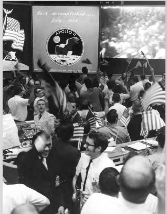
Overall view of the Mission Operations Control Room in the Mission Control Center, Building 30, Manned Spacecraft Center, showing the flight controllers celebrating the successful conclusion of the Apollo 11 lunar landing mission. (NASA image S-69-40023)

A memorandum of understanding between Johnson Space Center (JSC) and the University of Houston–Clear Lake (UHCL) permits the transfer, on a 10-year renewable loan, of selected historical documents to the UHCL University Archives. UHCL currently administers approximately 2,800 linear feet of JSC historical documents from the early human spaceflight programs.