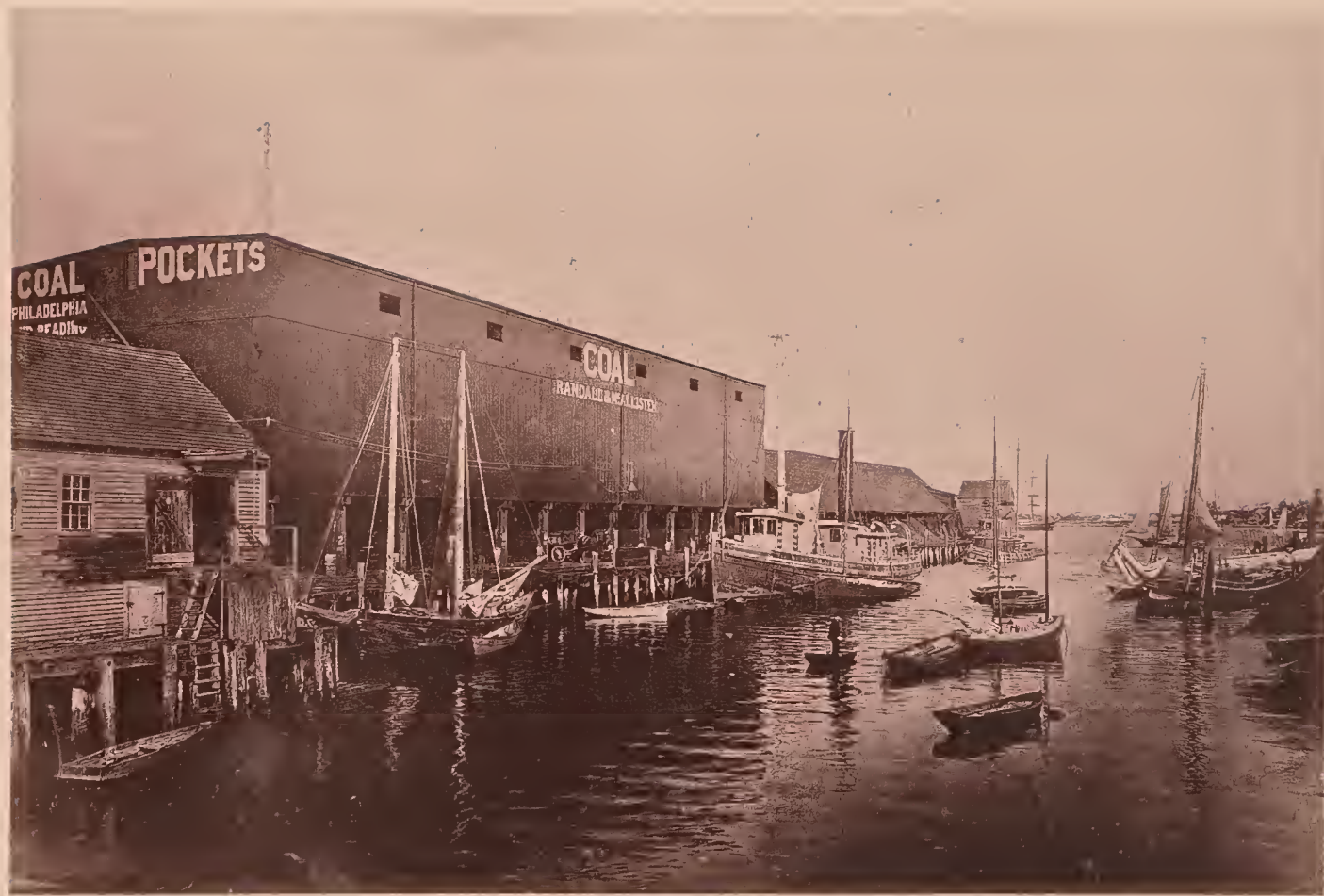
"RANDALL & MC ALLISTER'S COAL POCKETS."