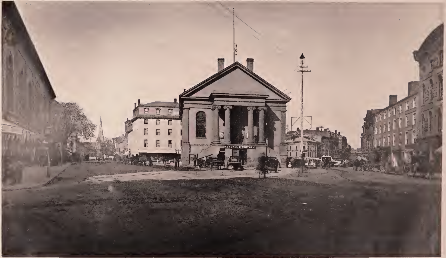
OLD CITY HALL, MARKET SQUARE.