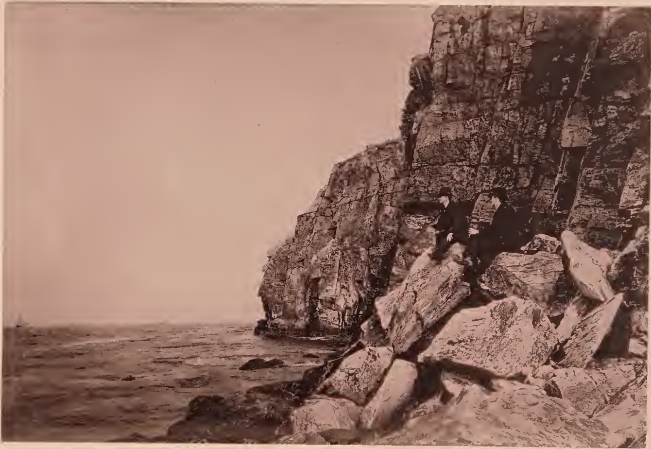
WHITE HEAD, CUSHING'S ISLAND.