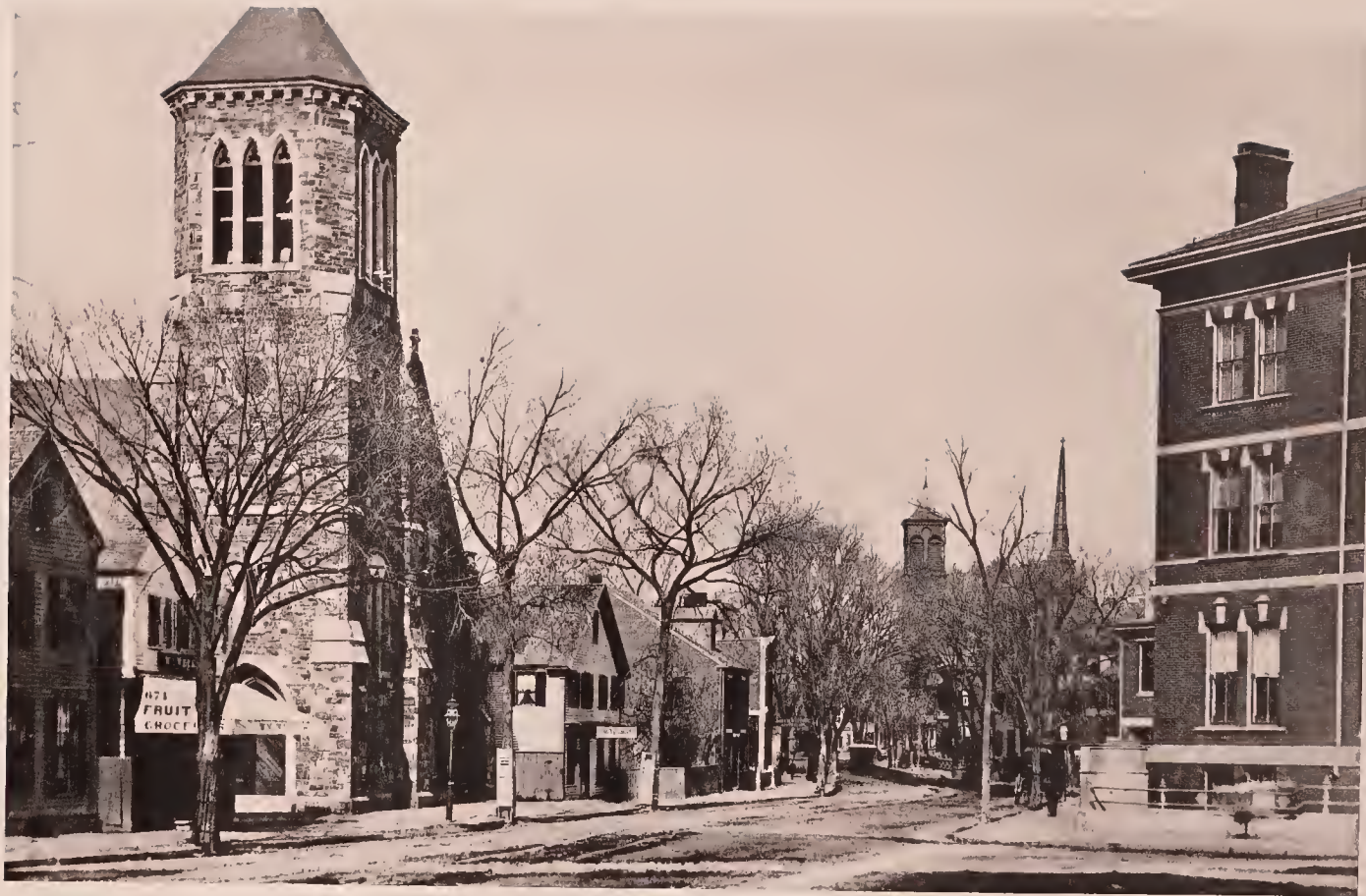
ST. STEPHEN'S CHURCH. LOOKING DOWN CONGRESS STREET.