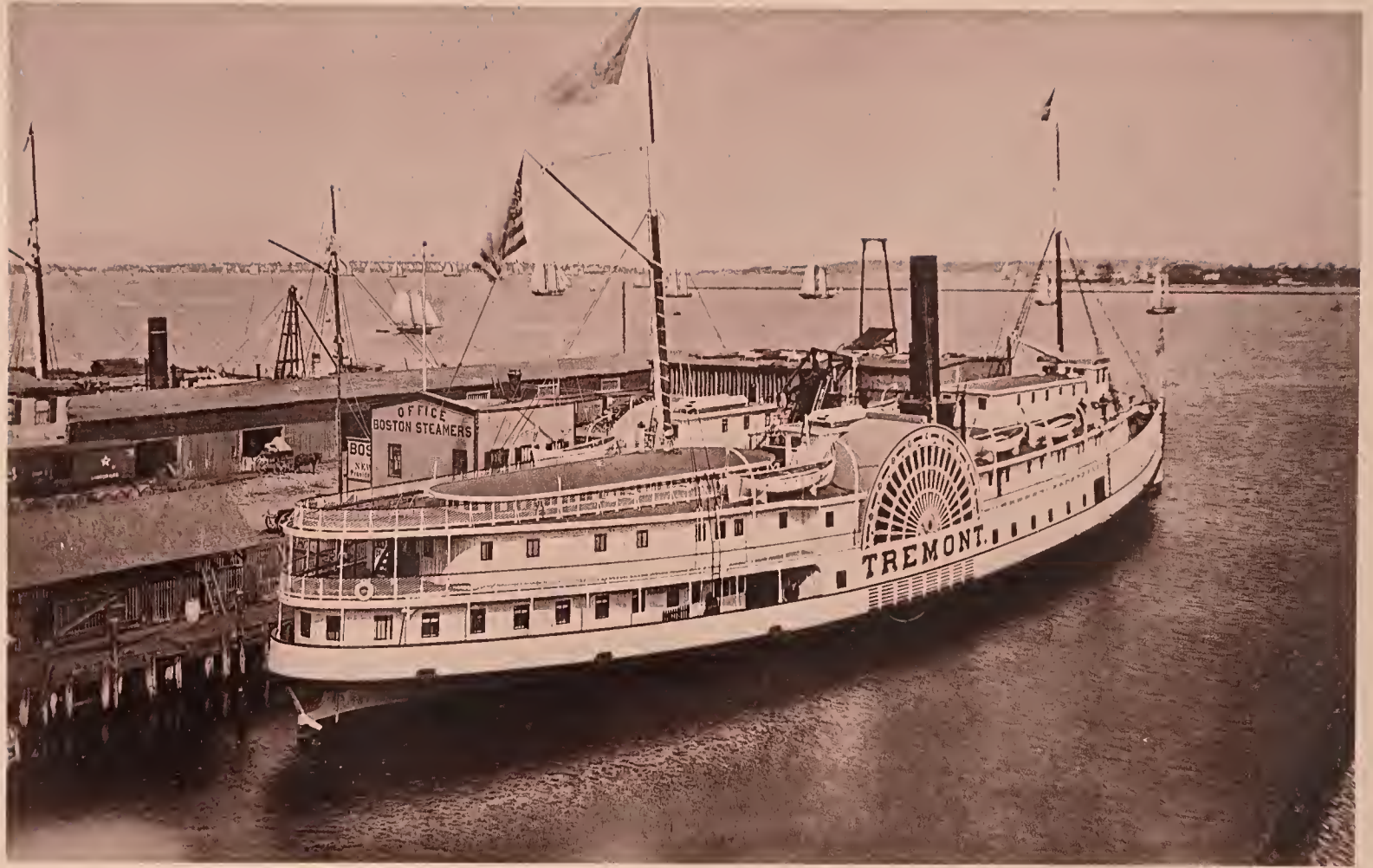
STEAMER TREMONT OF THE PORTLAND STEAM PACKETS' DAILY LINE TO BOSTON