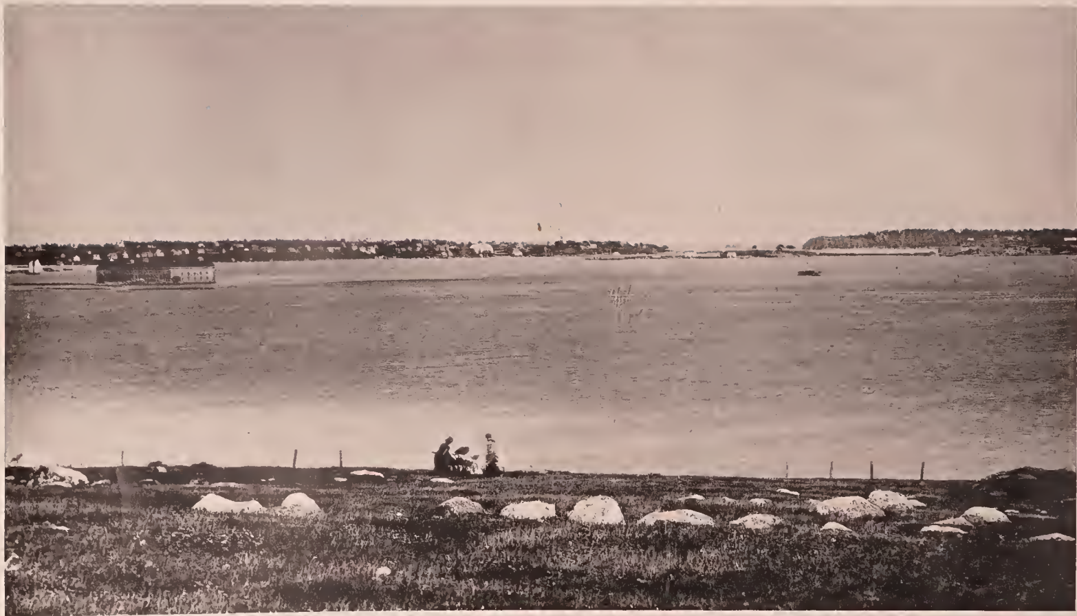
ISLAND VIEW, FROM EASTERN PROMENADE.