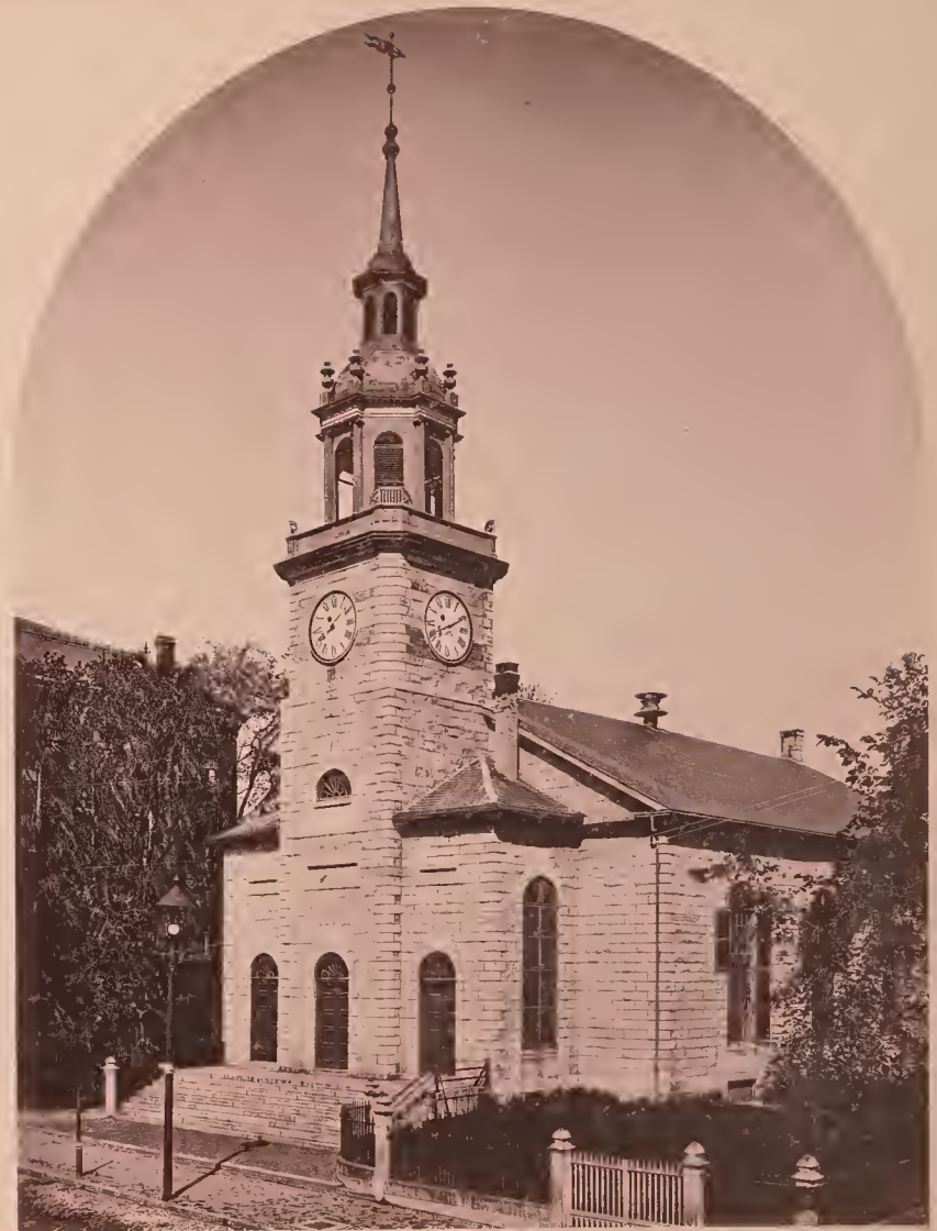
FIRST PARISH CHURCH.