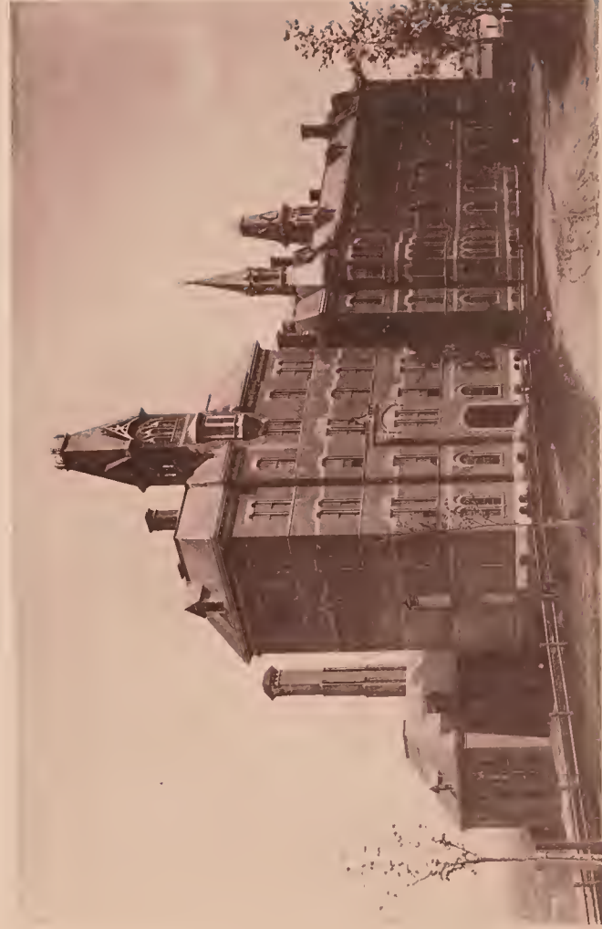
MAINE GENERAL HOSPITAL.