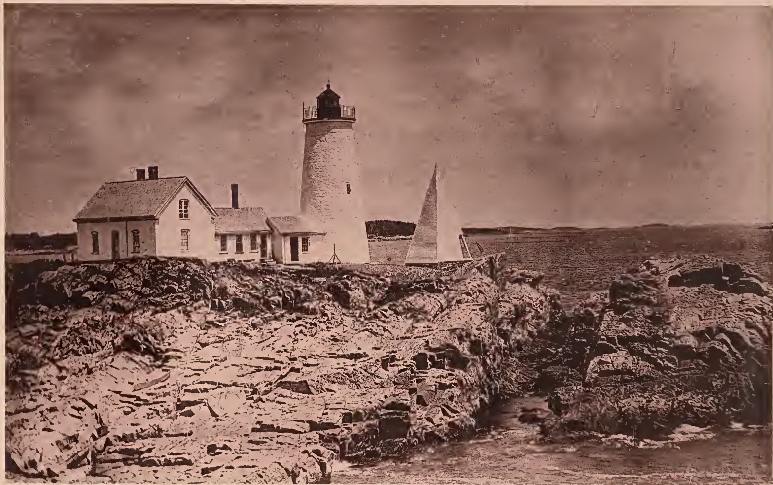
PORTLAND HEAD LIGHT