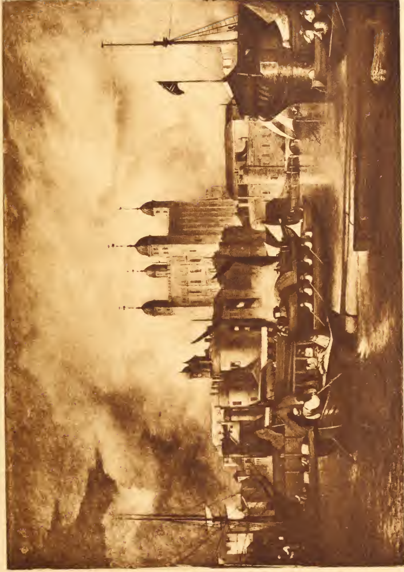
J. M. W. TURNER 1775 - 1851