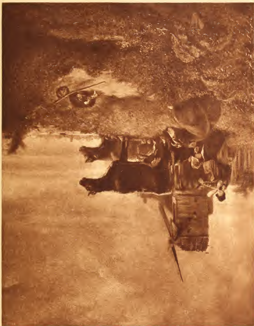
THE OLD MILL.