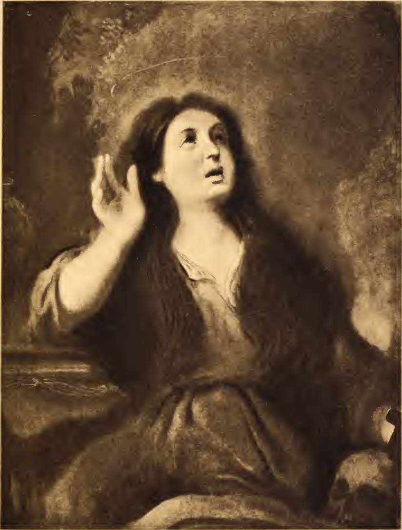
BARTOLOMÉ ESTÉBAN MURILLO. 1617 ~ 1682.