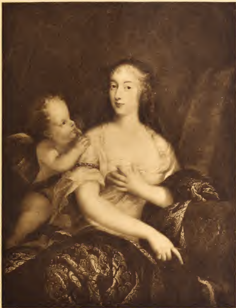
PIERRE MIGNARD. 1610 ~1695.