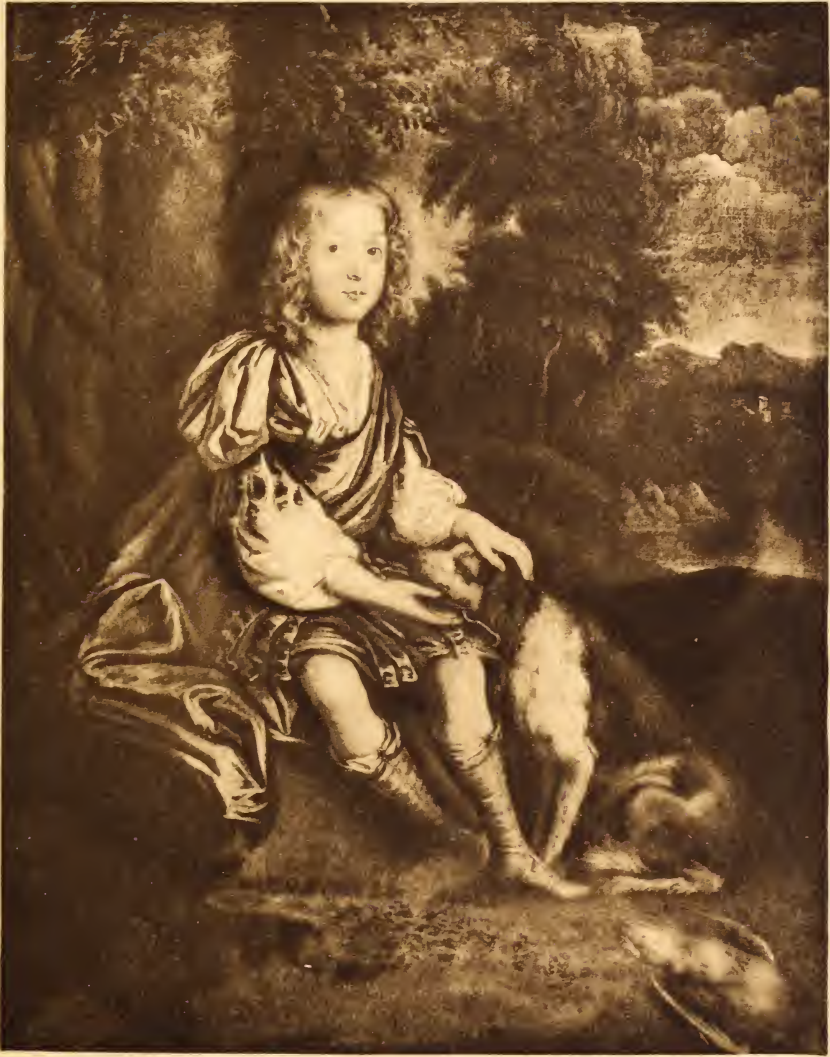
SIR PETER LELY. 1617-1680