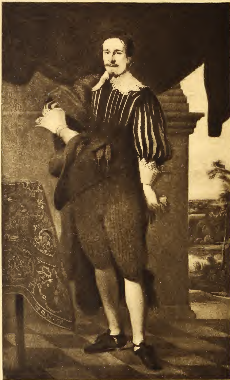
DANIEL MYTENS. 1590-1658