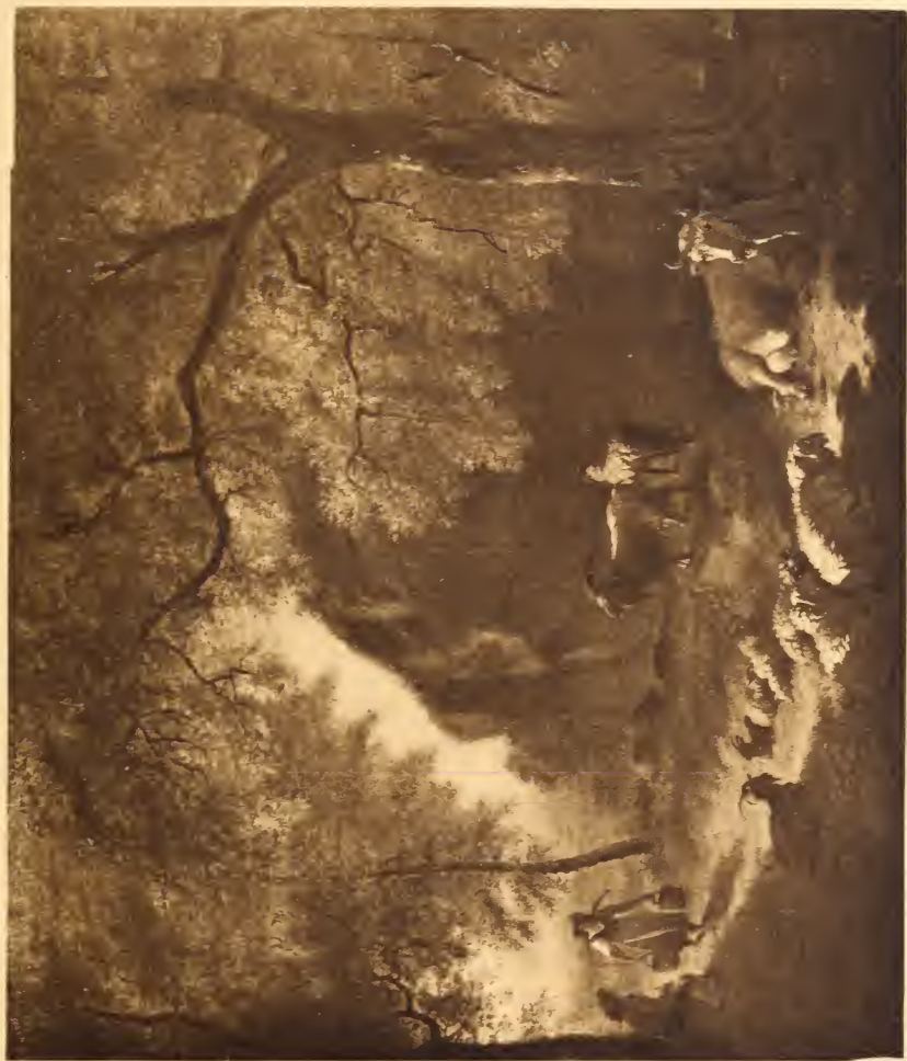
BALTHAZAR PAUL OMMEGANCK. 1755 ~ 1826.