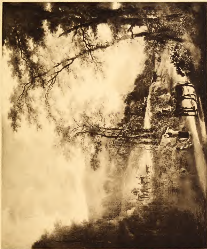
JAN BOTH 1610 - 1651.