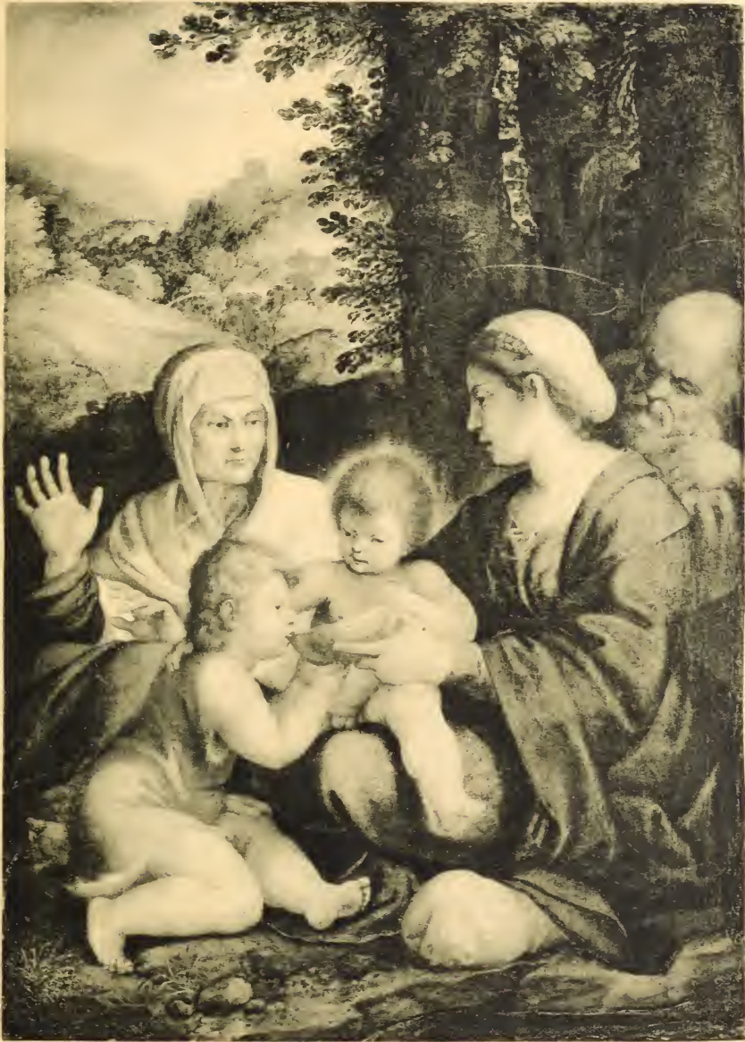
CORREGGIO 1494 - 1534