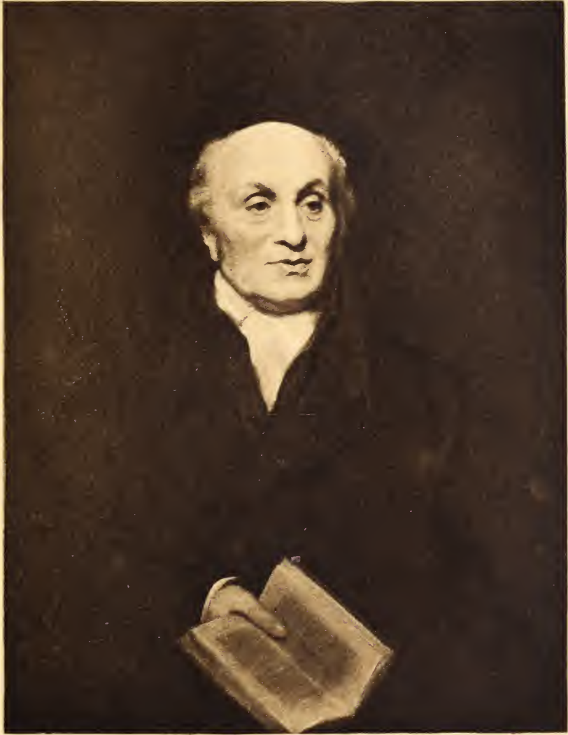
SIR HENRY RAEBURN. 1756 - 1823.