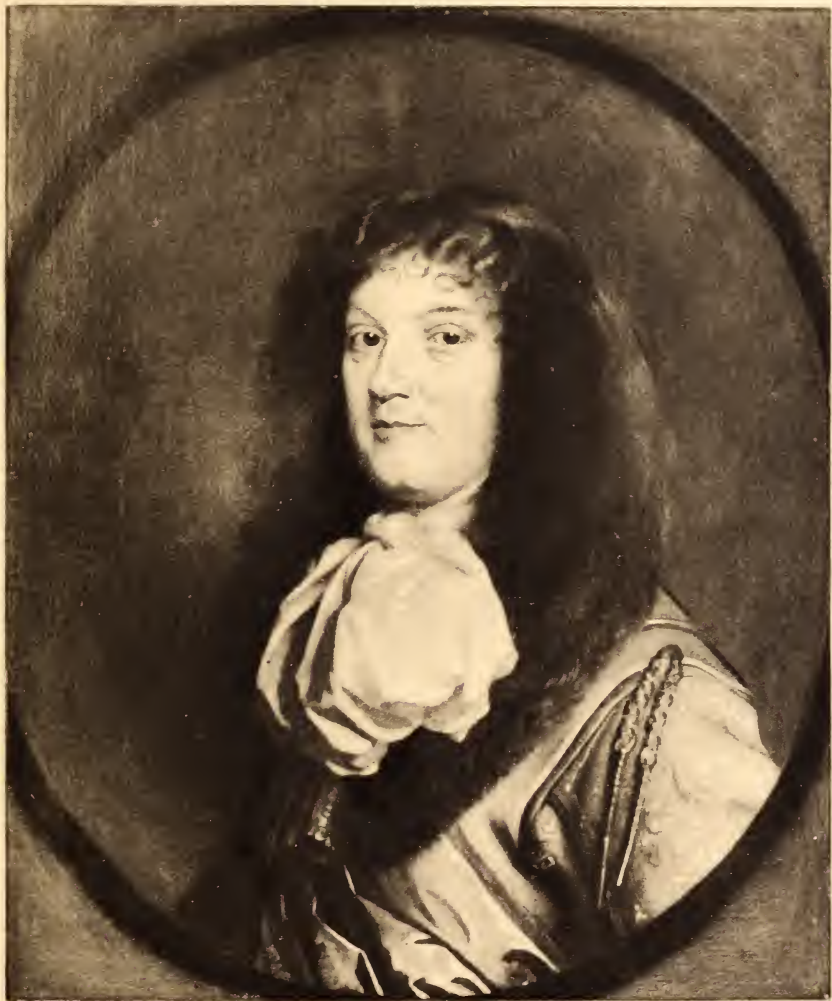
SIR GODFREY KNELLER. 1646 ~ 1723.