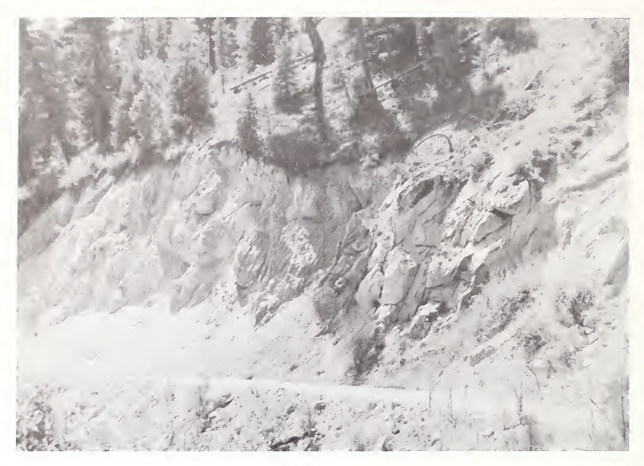
Figure 7.--Granitic rocks in the Idaho Batholith exhibit various degrees of weathering. Road cuts in the more highly weathered types continue to supply sediment for years.

1970) indicate that sediment production increases greatly after a major storm event such as occurred in December 1964 in California. The same storm hit Deep Creek and, coupled with the April 1965 event, apparently caused the increases found in Deep Creek. Anderson reports that high poststorm sedimentation tends to decrease with time; however, this trend was not detected in Deep Creek for the measurement periods following the April 1965 storm.