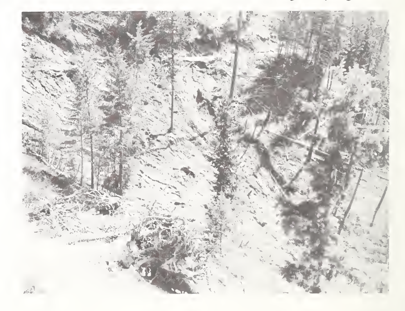
Figure 4.--View of the lower jammer road in Watershed 3, where the debris avalanche originated because of a road fill failure.

Additional erratic behavior was noted on Watershed 3. A natural landslide scarp existed on this watershed prior to road construction. This type of slide, classified as a debris avalanche (National Research Council, Highway Research Board 1958), is characterized by rapid downslope movement of soil and rock material having varying