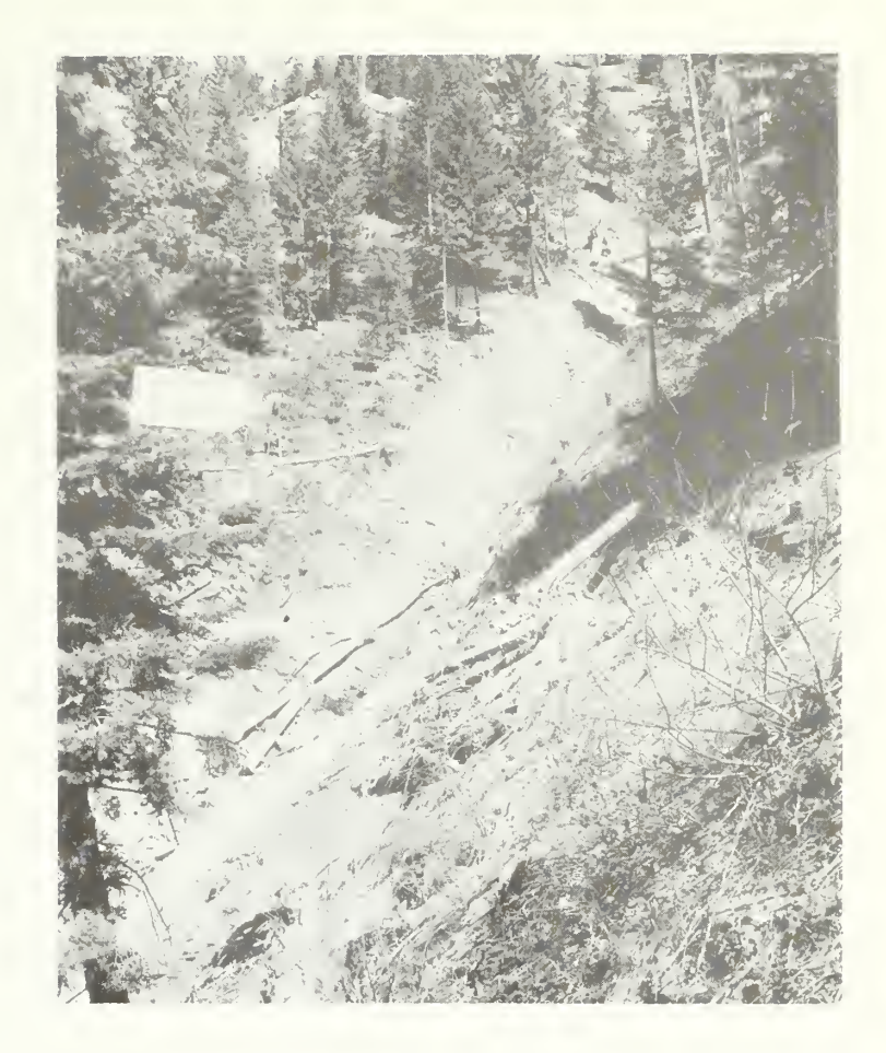
Figure 5.--The debris avalanche scoured the bottom of Watershed 3 to bedrock. The slide obliterated the sediment dam (formerly in the channel bottom) and splashed mud on top of the storage rain gage tower (see arrow).

water contents. Debris avalanches usually leave a discernible elongated scar to bedrock at the slide origin and often exhibit a characteristic downslope slide path. The lower jammer road in Watershed 3 was constructed through the old slide area without taking special precautions (fig. 2). In April 1965, a combination of rainfall and snowmelt generated a massive failure of the road fill material at the site of the old landslide (fig. 4). The slide scoured the entire length of the channel to bedrock in Watershed 3 and destroyed the sediment dam (fig. 5). Postslide measurements indicated that approximately 6,030 cubic feet of sediment moved down the channel.