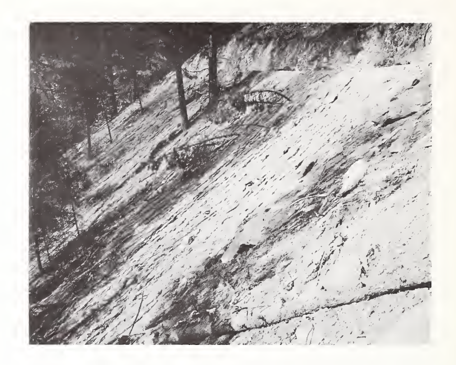
Figure 8.--Surface erosion on road fills constructed from granitic materials 1 year after construction.

the entire 6-year study period. Fredriksen (1970) reported similar slides on roads in steep, unstable terrain in western Oregon. Major failures of this type are not related to surface erosion rates, but rather tend to occur during large climatic events on those areas where the potential exists.