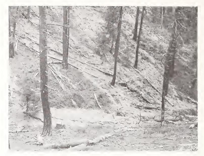
Figure 3.--Downslope sediment movement resulting from road erosion above. Sediment is easily traced because of the light color, coarse texture, and uniform gradation of the materials.

Sediment production during the first time period after construction was extremely high on Watersheds 1 and 2 but decreased rapidly in subsequent periods. However, this didn't occur on Watershed 3. A survey of sediment flow was conducted May 8, 1962, to examine this anomalous behavior on Watershed 3. The downslope movement of sediment on each watershed was mapped from its source to its downslope terminus. This is easily done because of the light color, the coarse texture, and the uniform gradation of the eroded material in this area (fig. 3). The cause of the limited sediment production on Watershed 3 was readily apparent; a barrier of logs and debris in the drainage bottom was catching the material en route (fig. 2).