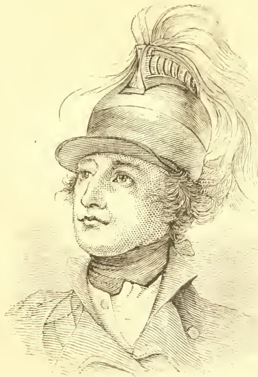
COLONEL BENJAMIN TALLMADGE. [FROM A PENCIL SKETCH BY COLONEL JOHN TRUMBULL.]

remonstrances of Major Tallmadge, would have been sent back to Arnold. He was with the prisoner almost continuously, and was