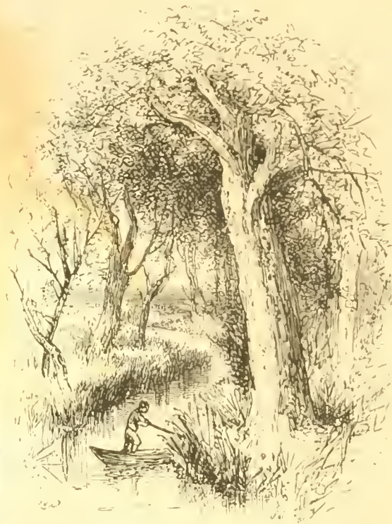
THE KING'S ALDER.

Physically the Wends are a powerful people, and resemble the American Indians. The men are tall, erect, and muscular; they are generally beardless, and, through exposure, their complexions acquire in summer a dark copper tint. The women work in the field with the men, and, as a rule, perform the hardest tasks. The heaviest burdens and the poorest tools are relinquished to them. This life tends, of course, to develop to a remarkable degree sinews which nature originally did not make too delicate. They are somewhat shorter than the men, and their massive limbs are the wonder of travelers. In Saxon Studies Julian Hawthorne describes the legs of the Dresden market-women. Far be it from me to question his statements. Any one who has had an opportunity of observing modestly the generous proportions of the Saxon will freely concede their claims. But the Wends are several degrees higher—or larger—in the