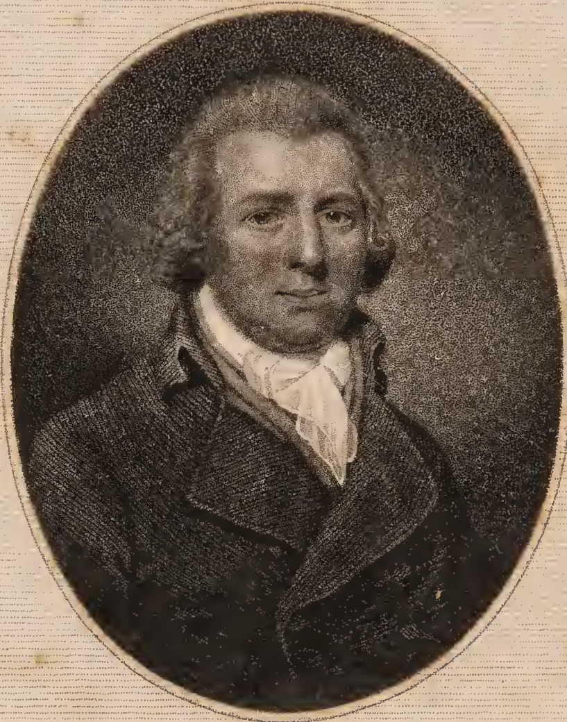
WILLIAM CURTIS AUTHOR OF THE FLORA LONDINENSIS BOTANICAL MAGAZINE &c.