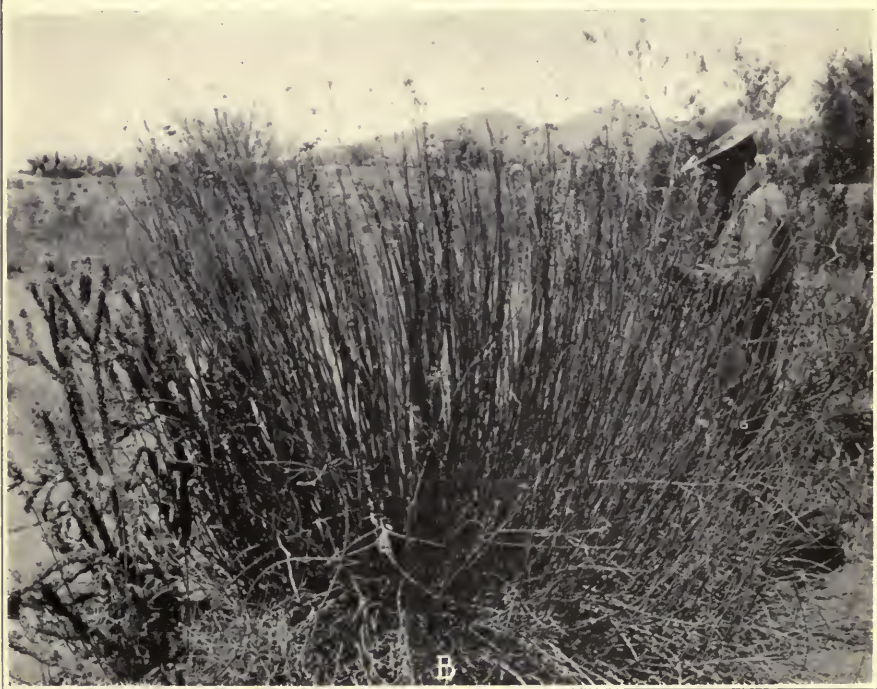
A. Community of Asclepias subulata in an arroyo near Mesa, Arizona. B. Individual plant of A. subulata , showing maximum size in nature.