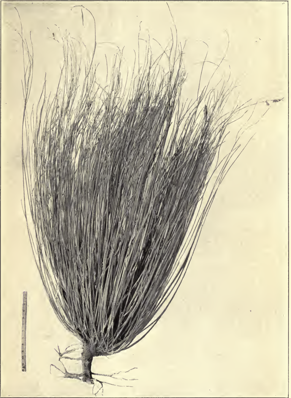
Asclepias subulata , collected at Sentinel, Arizona. Plant 5 feet high.