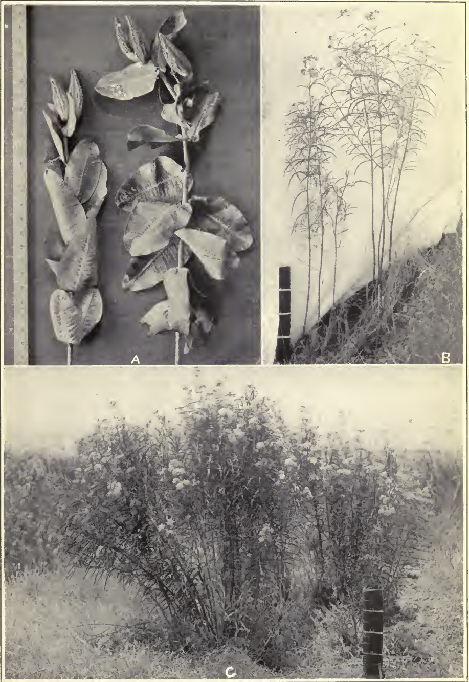
A. Asclepias sullivanti , collected at Lincoln, Nebraska.