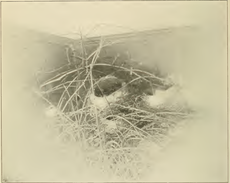
A GROUP OF ROBINS' NESTS AT EAST ORLAND, ME. BUILT THREE YEARS IN SUCCESSION. TO ACCOMPANY ARTICLE ON OPPOSITE PAGE.