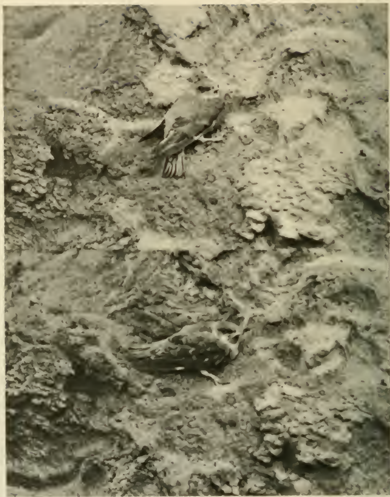
YOUNG BANK SWALLOWS, FROM PHOTOGRAPHS BY HOWARD H. CLEAVES. TO ACCOMPANY ARTICLE ON PAGE 8