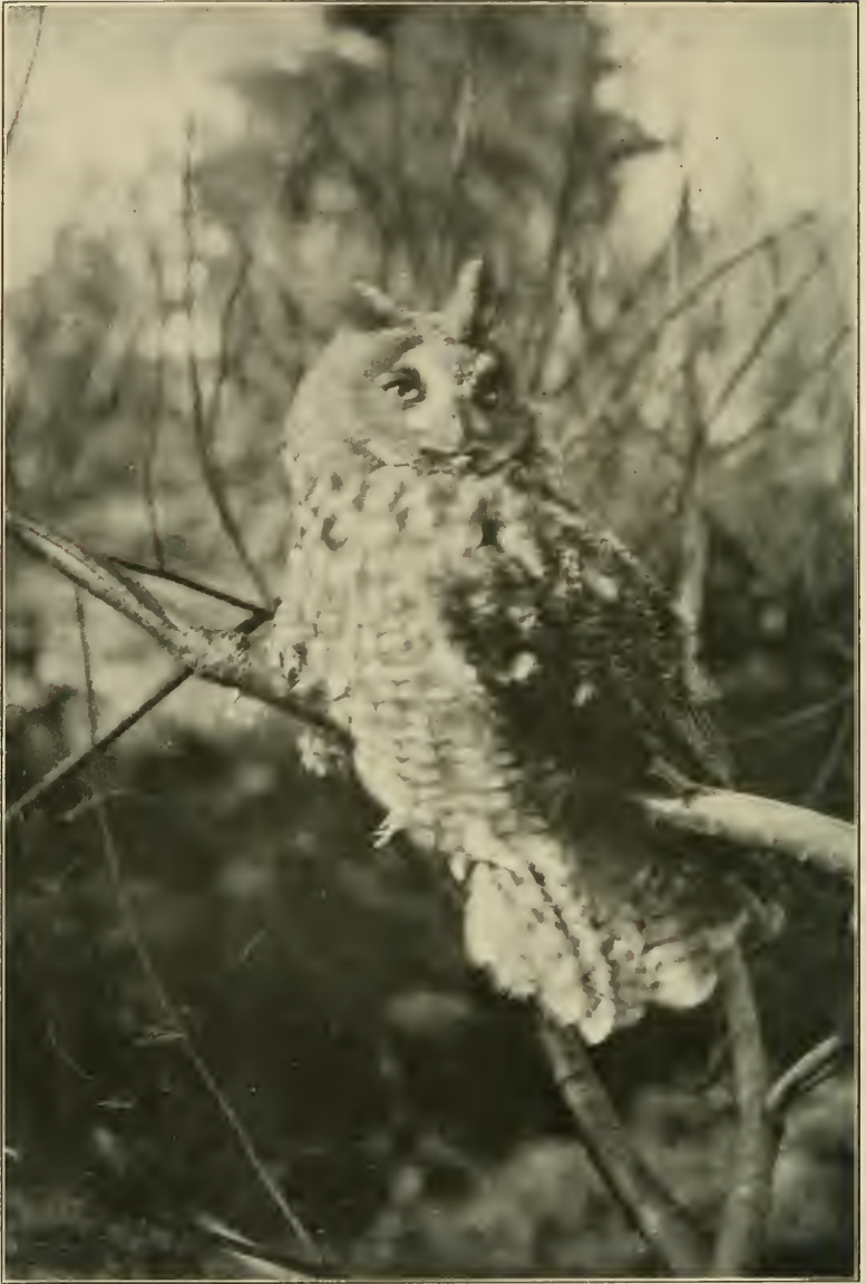
AMERICAN LONG-EARED OWL. (SAMBO.)

PHOTOGRAPH OF LIVING BIRD BY ORA WILLIS KNIGHT, BANGOR.