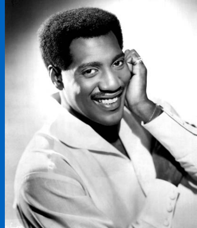
PD, Stax Records