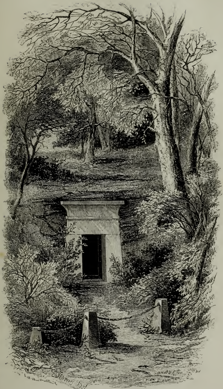
TOMB OF DR. KANE, In Laurel Hill Cemetery, near Philadelphia.