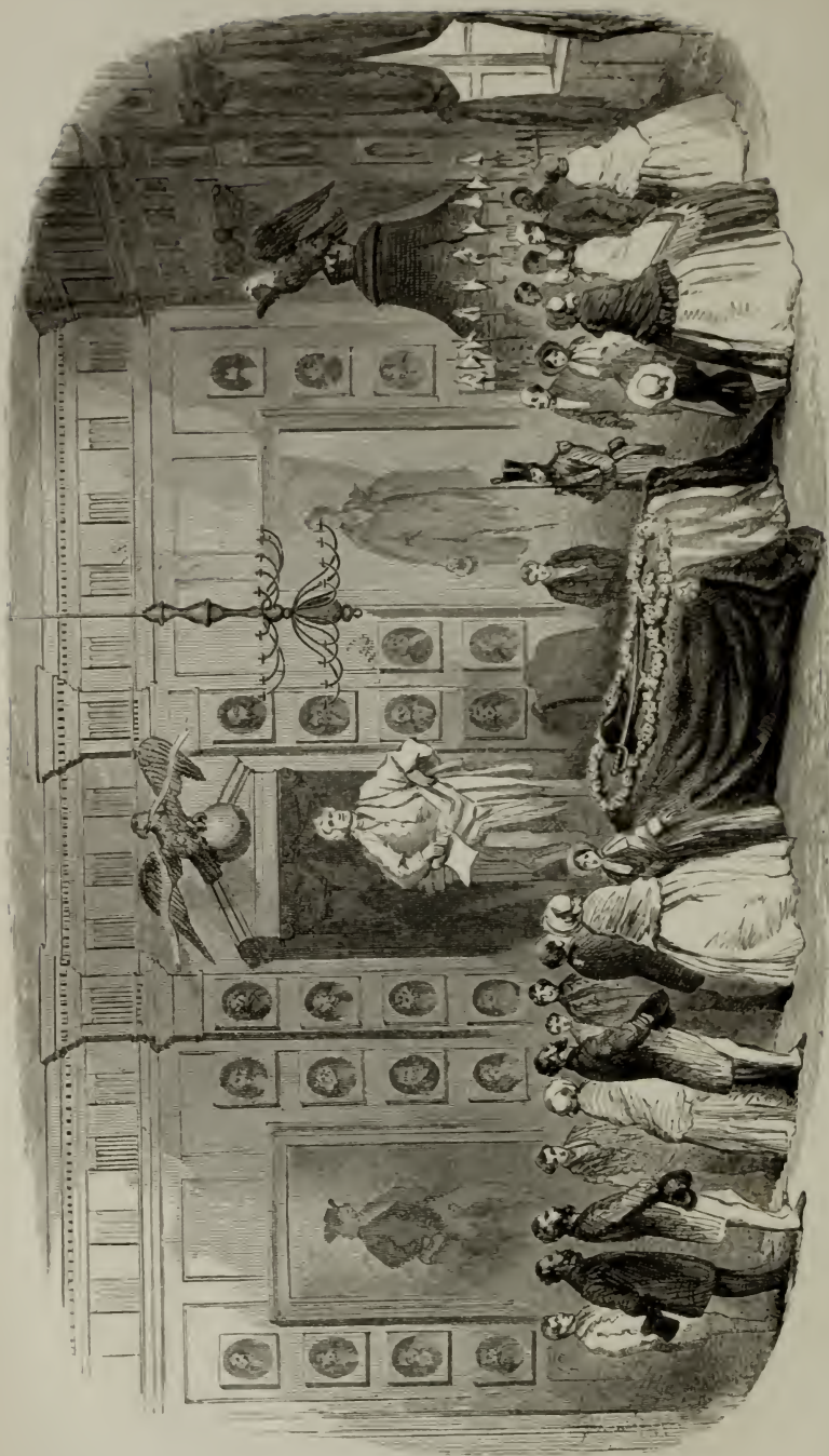
DR. KANE'S BODY LYING IN STATE, In Independence Hall, Philadelphia.