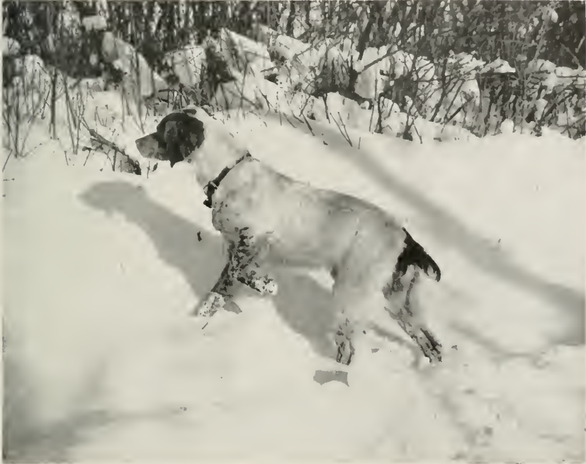
This Brittany Spaniel's tense point marks the hiding place of a pheasant in a snow-covered thicket.

"1. Keep the dog's head off from the ground; never let him develop into a trailer. The best method found by the author has