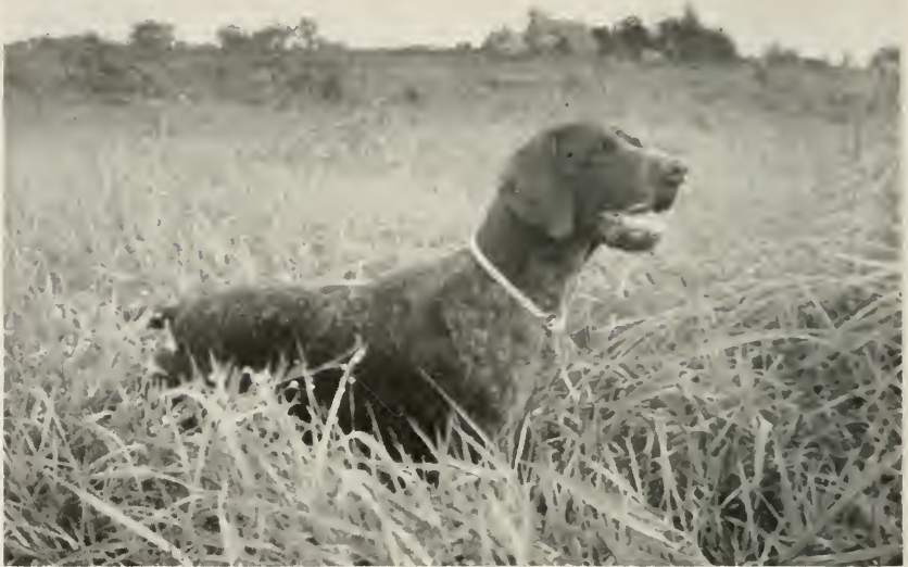
This young German Shorthaired Pointer shows the staunch pointing qualities that are characteristic of the breed.

In training the spaniel to quarter, you may use hand signals to advantage to indicate that he is to turn and quarter in the opposite direction. Some trainers use their dog whistles for no other purpose than to turn the dogs. Perhaps the most useful device you can use in training your young dog to quarter properly is to follow a zigzag course over the field, always working into the wind in early lessons. When the puppy sees you change your course he will usually swing back to keep ahead. Occasionally you may find it necessary to start to run to arouse his interest in what lies ahead of you. After the dog has learned to quarter properly, you may reserve whistle signals or voice signals for special occasions when it is necessary to get his attention.