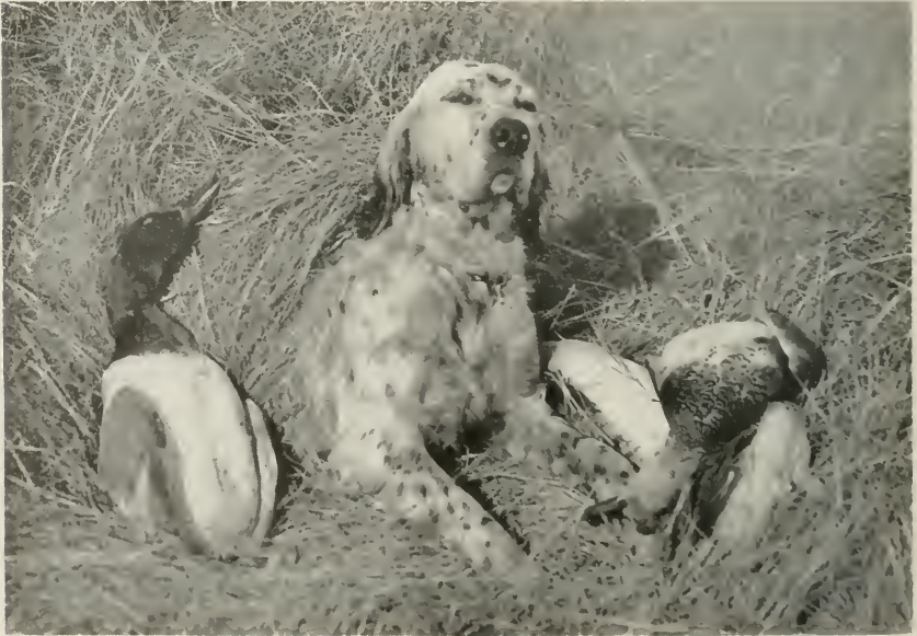
Although trained on upland game birds, setters occasionally fill in as waterfowl retrievers. This English Setter served as pick-up dog during a shoot on a duck pass in North Dakota pheasant country.

Most upland bird hunting is, of course, done with the pointing and sporting spaniel breeds, and in these dogs ability to retrieve is especially important from the standpoint of reducing crippling losses of upland game. Many of the pointing dogs and sporting spaniels owned by Illinois hunters are trained for the dual purpose of finding and retrieving. In the case of the spaniels, training to retrieve is doubtless given considerable impetus by the fact that they are expected to retrieve in field trials. Retrieving is not included in field trials for the pointing breeds. In regard to trials for pointing dogs, the late Professor Howard M. Wight