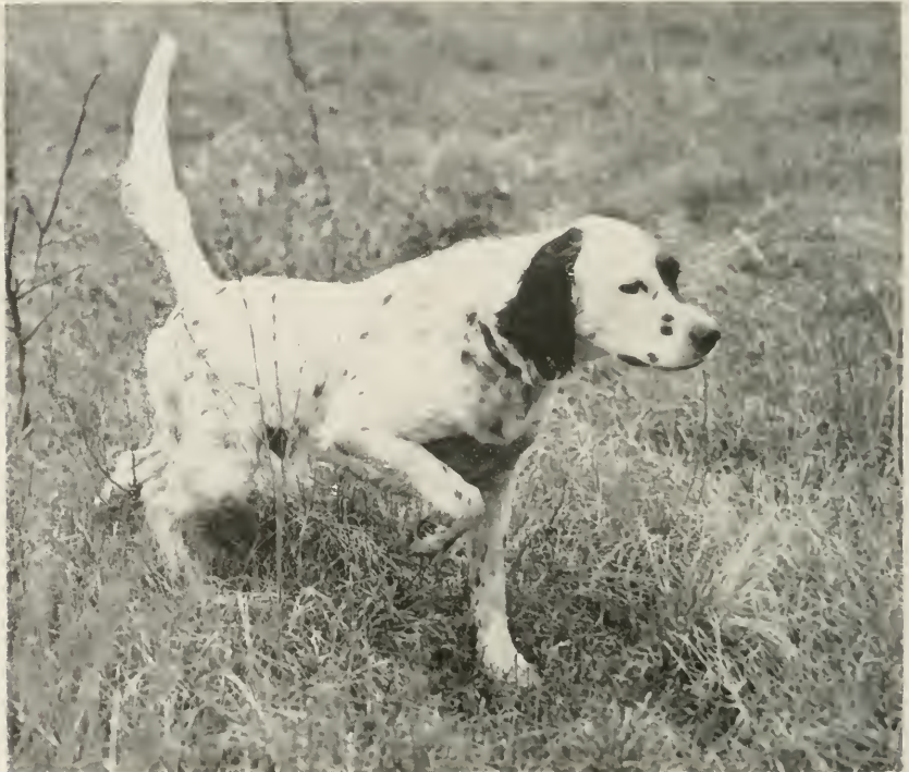
An English Setter points a covey of quails. The many setters, pointers, and spaniels trained to retrieve game help to reduce crippling losses among upland game birds.

As the puppy develops and learns to take directions, you should become accustomed to giving them in a firm, distinct voice, making sure that each command is understood and carried out. The commands should be short, and the same words should