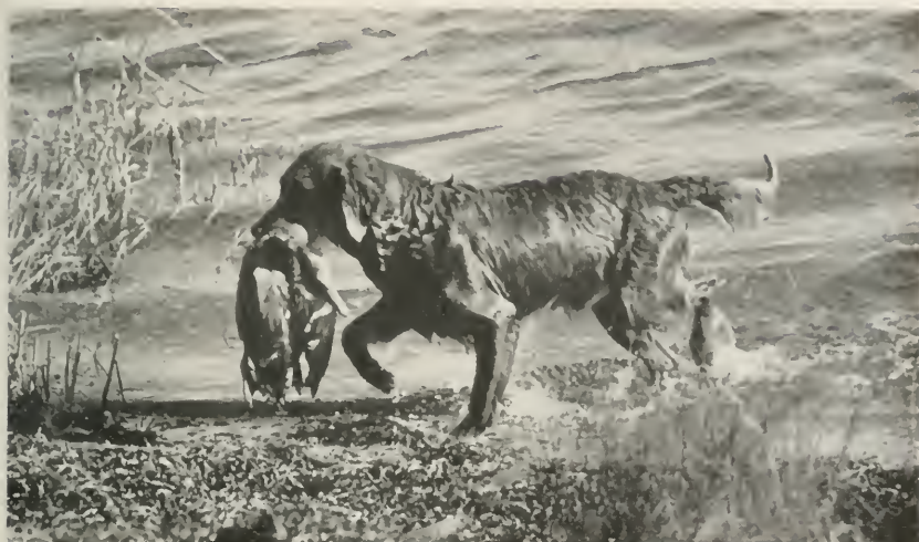
A Golden Retriever brings in a duck. Estimates of the number of ducks wounded or killed and not recovered in Illinois range from one-third to one-half the number bagged. Greater use of trained retrievers could materially reduce this loss.