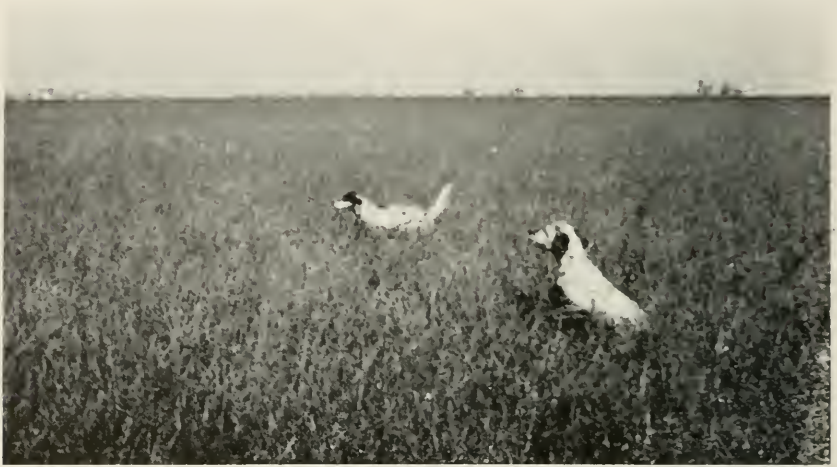
Two English Setters spot a pheasant in a central Illinois stubble field. The rear dog has stopped short to honor the other's point. Trained bird dogs such as these are of much value in game studies.

The past two decades have seen a remarkable growth of research in the field of wildlife conservation. Throughout the country, biologists in colleges, in universities, and in state and federal conservation agencies are gathering facts on the basic requirements and behavior of game and other wildlife. This