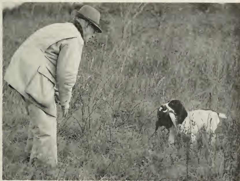
A Cocker Spaniel retrieves a wounded pheasant. Despite small size, the hunting strains of Cockers are splendid field dogs.