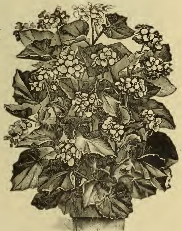
SEMPERFLORENS GIGANTEA ROSEA.

Large, plain green foliage, pink flowers. 75 Cents per dozen.