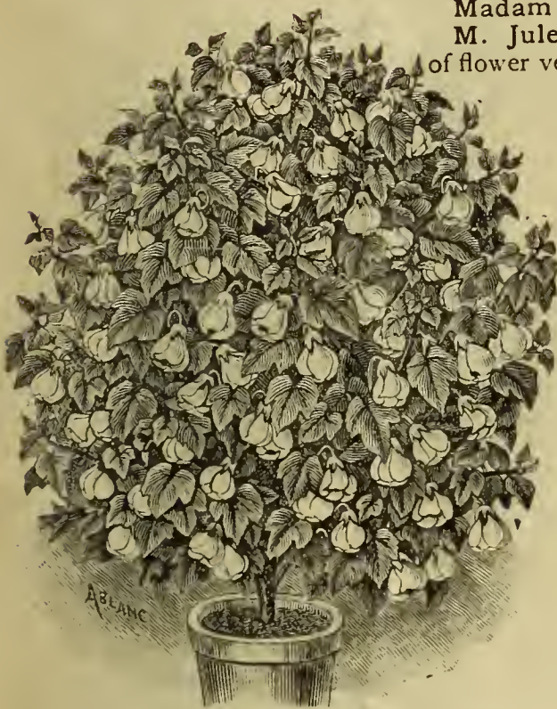
NEW ABUTILON GOLDEN FLEECE.

Boute de Niege —White; 50 Cents per dozen, $4.00 per 100.