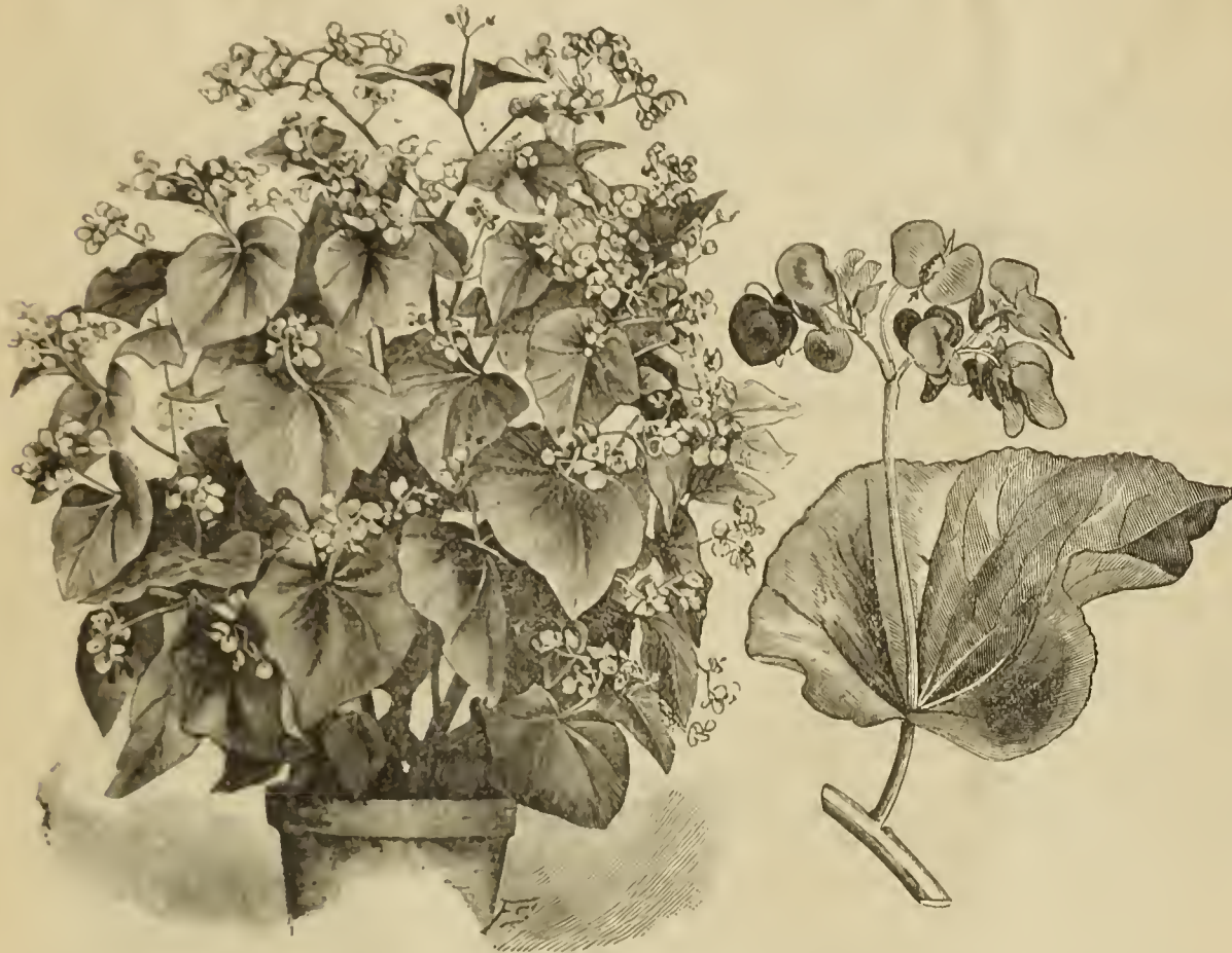
SEMPERFLORENS GIGANTEA AMELIA.

This wonderful free growing Begonia of sterling worth and great beauty. This has the habit of frequently blooming at the junction of the ribs of the leaf, and it imparts a novel appearance when exhibiting this peculiar character; a compact grower; flowers a carmine rose, produced in great abundance in winter and spring months. (See Cut Below.) 15 Cents each, $1.50 per dozen.