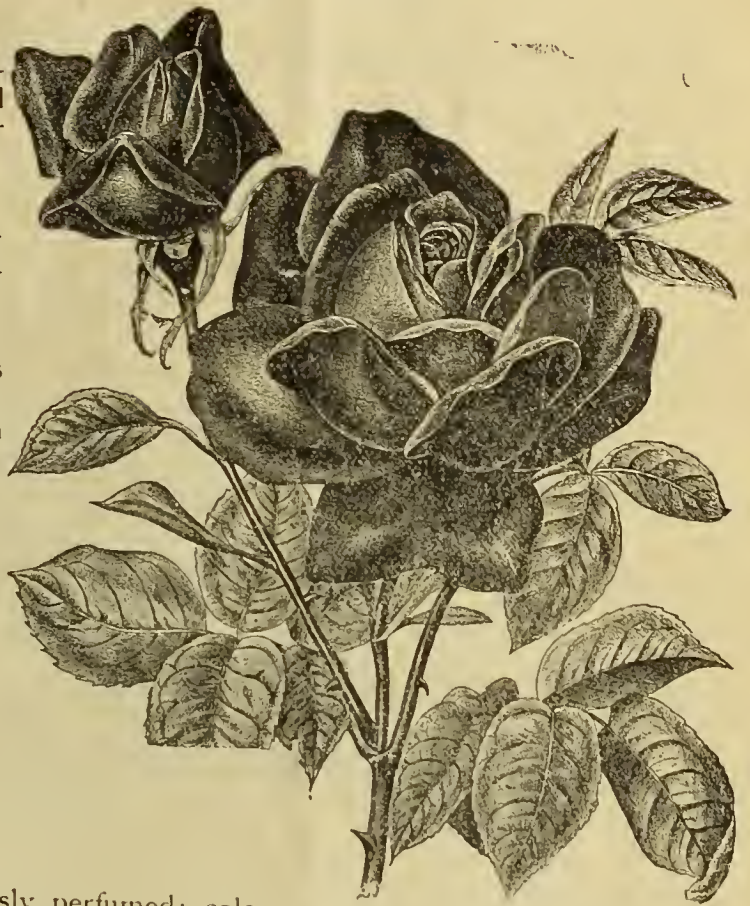
SOUV. THERESE LEVET.