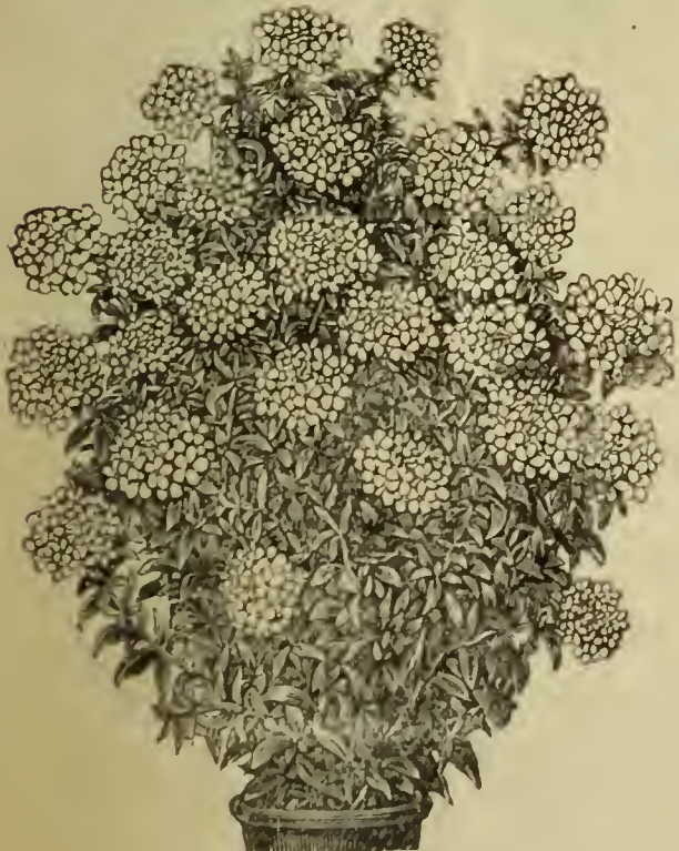
CAPENSIS FLORA ALBA.

Multicolor —A strikingly handsome variegated plant, of trailing habit; leaves longitudinally striped with pink and white, fine for baskets. Our stock exceptionally well colored. $4.00 per 100.