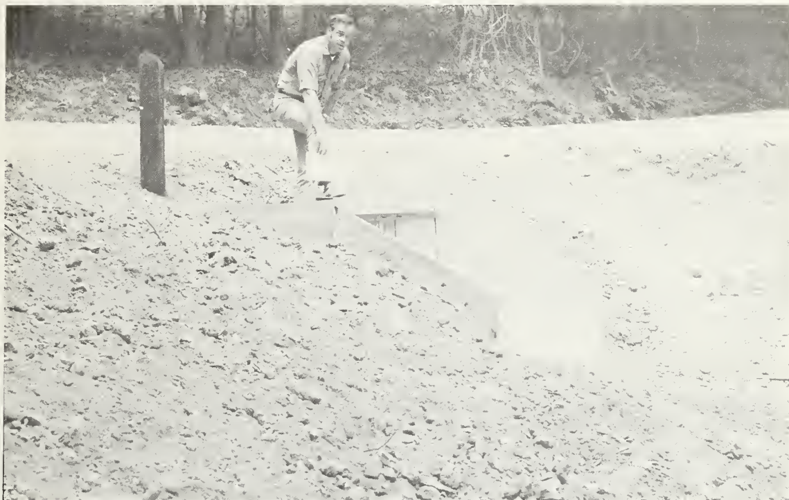
Figure 5. Dissipator right after being installed at relatively "stable" site.