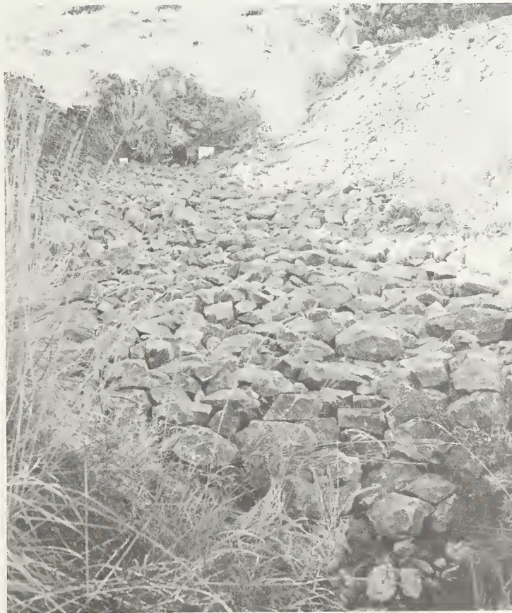
Figure 1. Typical rip-rap site, Toiyabe National Forest, Calif.

In an attempt to dissipate the energy of the water carried by specified drainage devices and thus reduce the potential for erosion, engineers have placed rocks, concrete posts, or similar material ("rip-rap") at the outlets of the flumes and culverts. Usually the material for these rip-rap sites (fig. 1) has to be imported and the ground at the outlet has to be trenched out to hold the material. The material is then placed, frequently by hand, in a very irregular manner in an attempt to interrupt and deflect water flow and spread the flow stream. These efforts are often frustrated because either the rip-rap itself is washed away or sediment, carried by the water flow, is deposited at the rip-rap site, causing the rip-rap to be less irregular, thus reducing its energy dissipating capability.