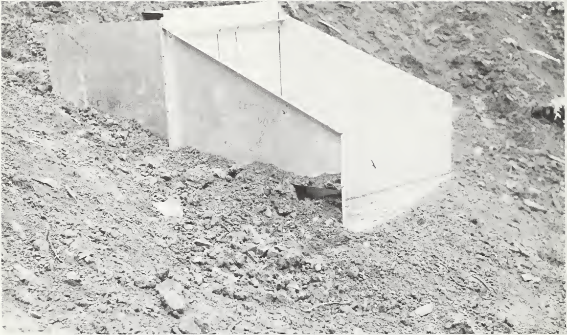
Figure 3. Dissipator installed at "severe" location.