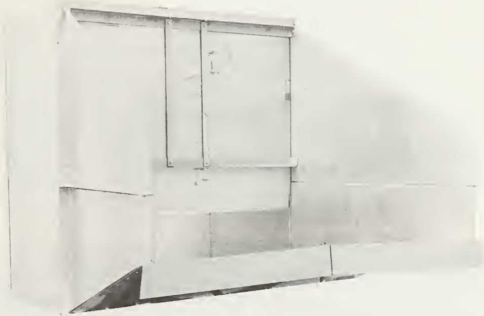
Figure 2. Energy dissipator based on results of hydraulic model studies.

A full-size dissipator, fabricated by scaling up the Bureau's design (fig. 2) was tested by SDEDC engineers in the bed of the San Gabriel River on the Angeles National Forest, Calif. The results looked promising; it was effective at reducing flow energy and exhibited self-cleaning action, even for rocks up to 8 in in diameter. Fabrication of 20 of these dissipators proceeded at SDEDC, and Forest Service Regions were asked to select locations for dissipator placement.