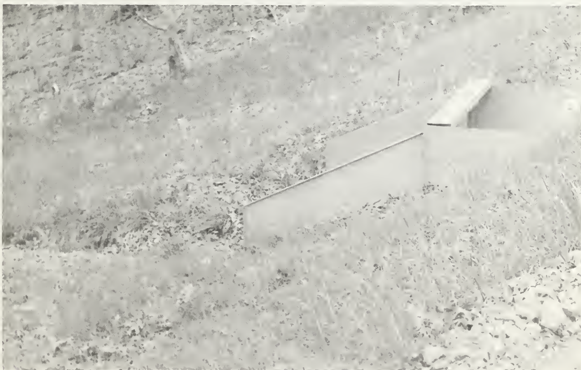
Figure 6. Dissipator has successfully stemmed erosion at the "stable" site.