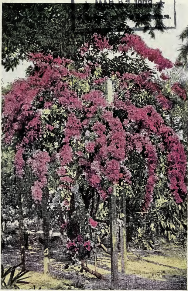
BOUGAINVILLEA CRIMSON LAKE