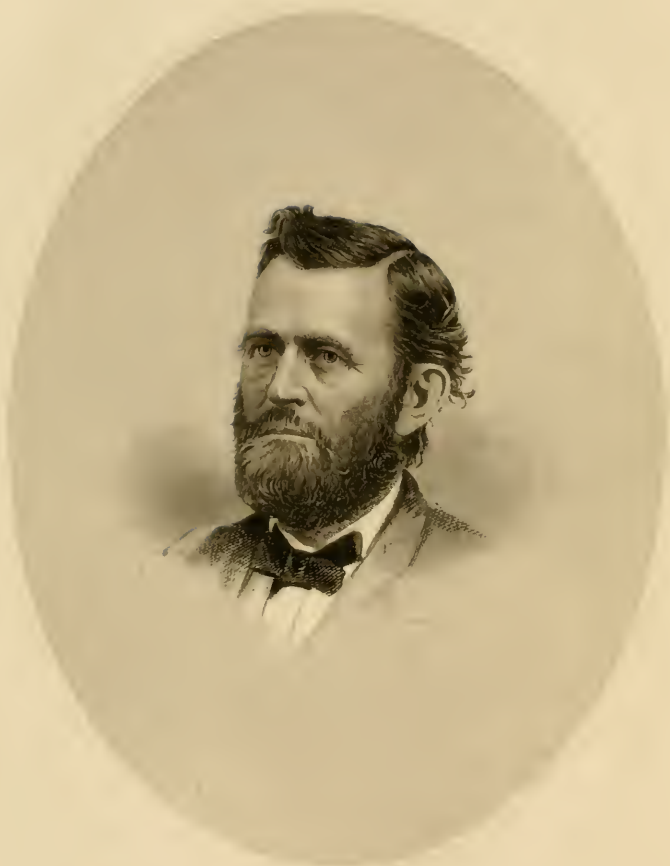
U. S. Grant Lt. Gen. U.S.A.