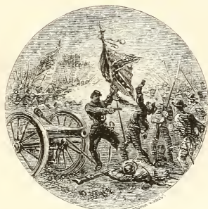
CAPTURE OF THE 8th LA. COLORS BY LT. YOUNG, ADG'T 107th OHIO VOLS.

The original plate has not been used except to print copies for transfers . The first impressions from each transfer are reserved for PROOFS. Therefore the quality of the print can never materially change, as the original plate would furnish a thousand transfers. The colored PROOFS are carefully colored by an Artist. The TINTED and PLAIN editions are next printed, and when the plate is worn a new transfer is made.