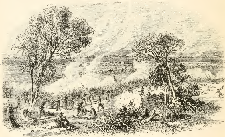
STANNARD'S BRIGADE OPENING ON PICKETTS' DIVISION.

Since the publication of the Drawing, and even before, I have been steadily engaged in compiling the History of the Battle of Gettysburg. I have traveled many thousand miles to add to my knowledge. I have received a great number of letters relating to it, and the Government have very considerably placed at my disposal the entire Reports of both the Union and Confederate officers; and have also given me access to the archives at Washington. They have recently ordered a re-survey of the field, which is now being done by Government Engineers in the most complete and scientific manner. A fine Topographical map is to be com-