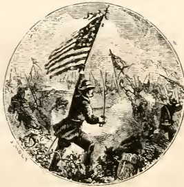
COL. MORROW, with the COLORS of the 24th MICH. VOLS.