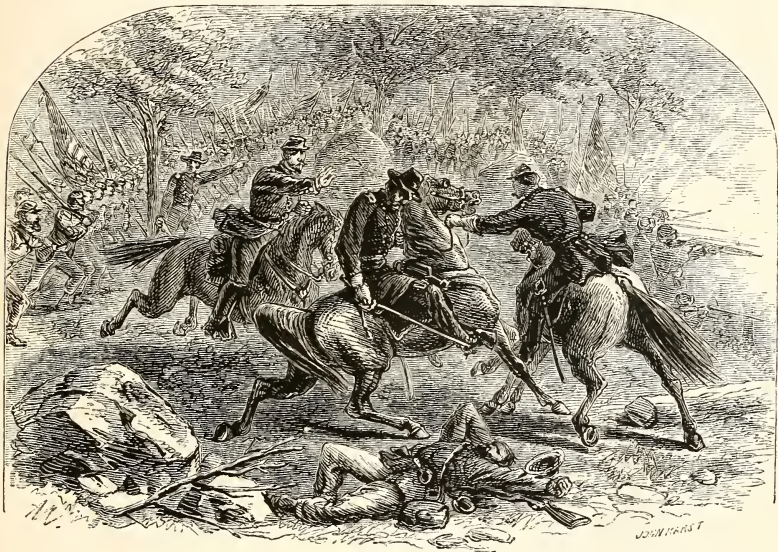
DEATH OF GEN. ZOOK.

As the term field , when applied to a battle, is generally used figuratively, and, by the general reader, might be misunderstood, it is well to consider at the start, that the battle- field of Gettysburg not only embraces within its boundaries many fields , but forests as well, and even the town of Gettysburg itself is included in that battle-field. The formation of the ground and the positions of the troops, favored the plan of sketching the field while facing the west. Consequently the top of my DRAWING of it is west; the right hand, north; the left, south, &c. There was no point from which the whole field could be sketched, nor would such a position have favored this branch of Art. On the contrary, it was necessary to sketch from every part of the field, combining the whole into one grand view.