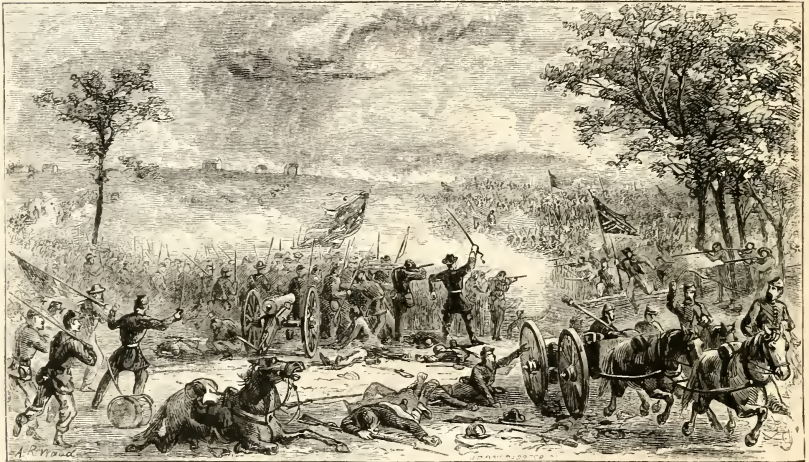
REPULSE OF LONGSTREET'S CHARGE.

I have divided the Battle into a series of episodes, beginning with its commencement and continuing to its close, each to embrace such movements and operations as of themselves form a complete unit. Of each, I make an accurate historical design, which design I place in the hands of some eminent battle-scene painter, who will be responsible for the artistic rendering of the subject. Each painting is to be 7x4 ft., and when completed, will be exhibited in the places