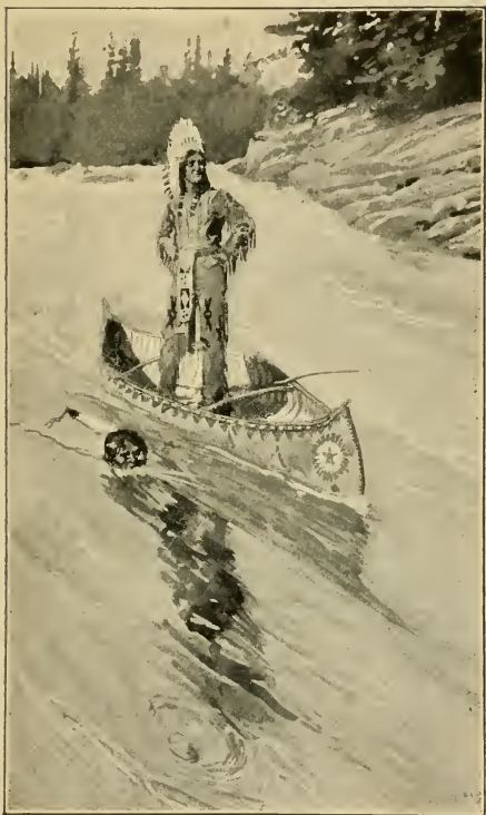
"DOWN THE RUSHING TAQUAMENAW."