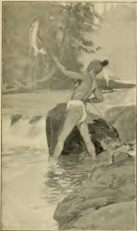
“ CAUGHT THE FISH IN LAKE AND RIVER.”