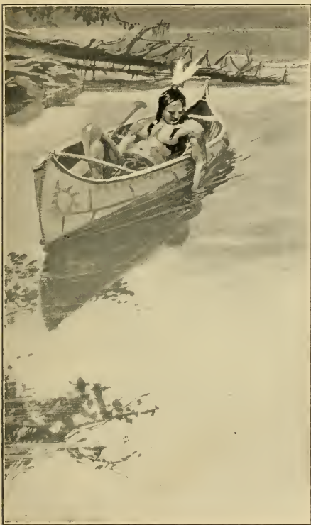
“ FLOATING SLOWLY DOWN THE CURRENT.”