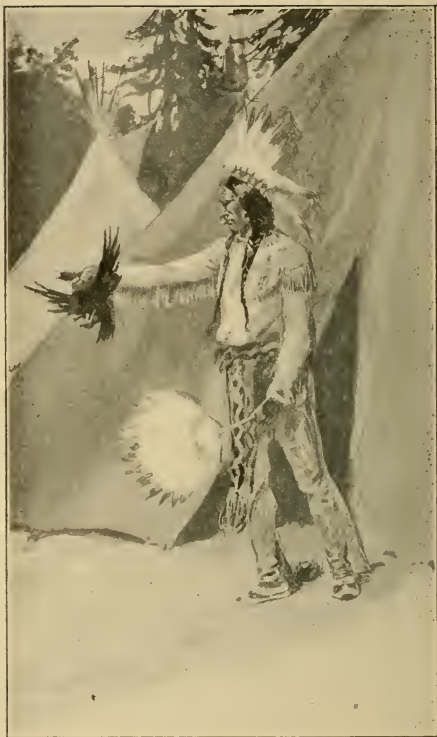
“ BY THE NECK HE SEIZED THE RAVEN.”