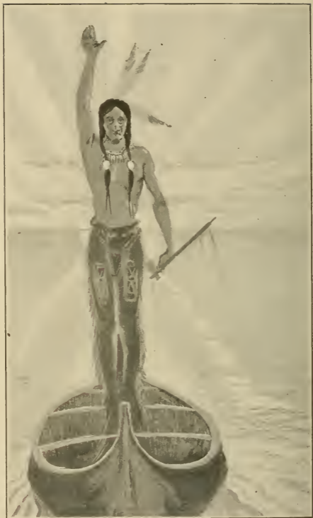
"WESTWARD, WESTWARD HIAWATHA SAILED INTO THE FIERY SUNSET."