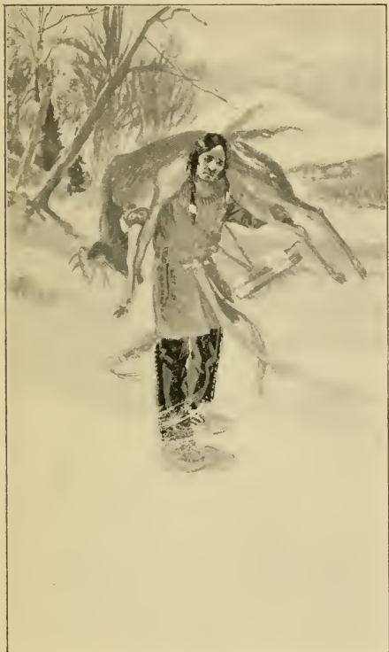
“AND THE RED DEER ON HIS SHOULDER.”