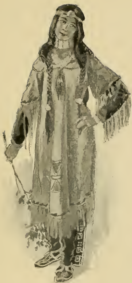
“MINNEHAHA, LAUGHING WATERS.”