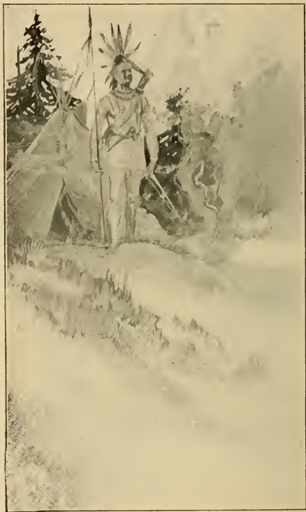
"COME THE MIGHTY NEGISSOGWON."