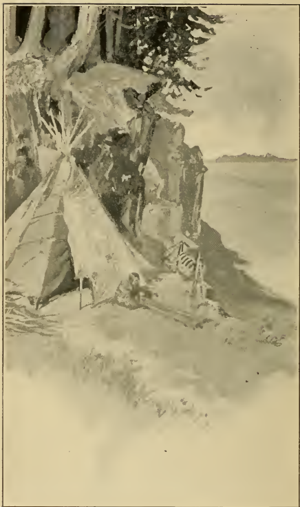
"STOOD THE WIGWAM OF NOKOMIS."