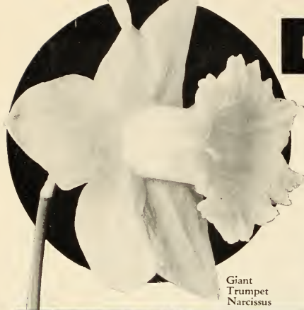
Giant Trumpet Narcissus

Thriving in almost any soil, the Narcissus is a most satisfactory bulbous garden subject. It is hardy and multiplies each year, paying dividends of more flowers. Their graceful nodding heads present an enchanting picture in spring, as they seemingly trumpet their announcement of spring's arrival.