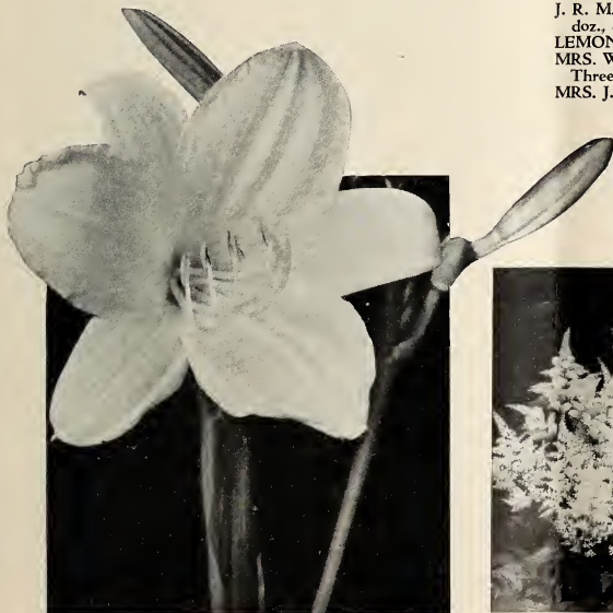
New Hemerocallis, Mrs. W. H. Wyman