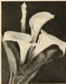
Yellow Calla Lily For House Culture