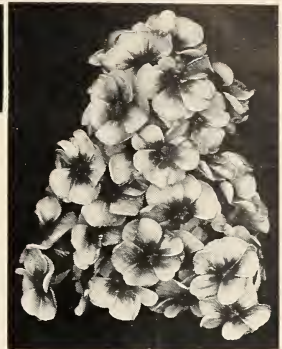
Hardy Garden Phlox

12 FINE PERENNIALS - Special Collection PRICE Only $2.75