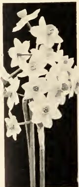
Soleil d'Or (Yellow Paper-White)

If the situation abroad should change, in sufficient time, so that we are assured we can receive a shipment from Holland, we will issue a special Tulip catalog.