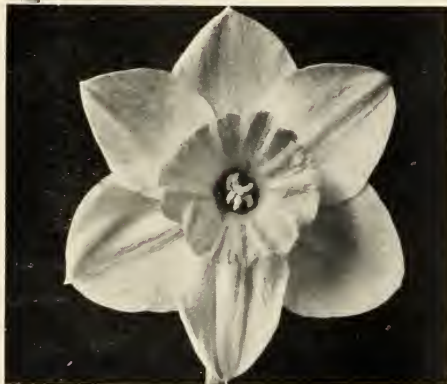
Medium Trumpet Daffodils

GLORY OF SASSENHEIM. Perianth pure white, trumpet rich yellow. Each, 13c; three, 30c; doz., 95c; 100, $7.00.