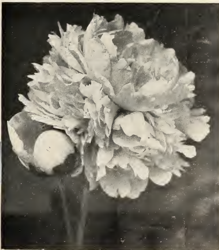
A Typical Flowerfield Peony—Photograph Half Size