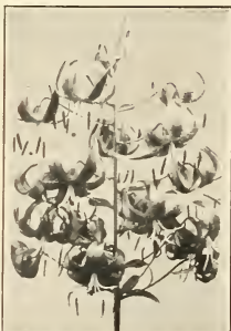
Superbum—One of the Best

For Best Results Plant 3 or More OF A VARIETY