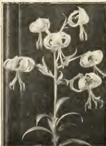
Henryi—Rich Apricot-Yellow From China

Plant This Fall for Next Summer's Flowers