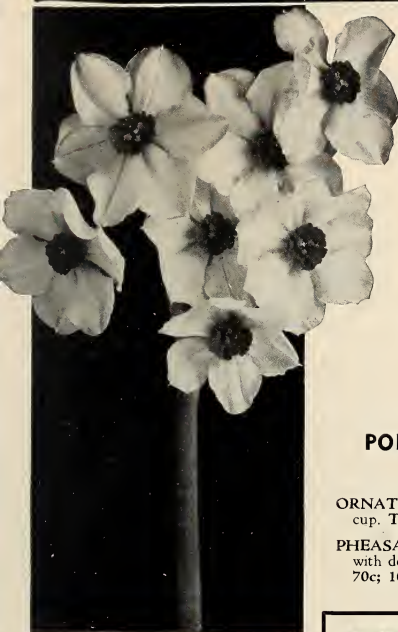
Narcissus Poetaz, Orange Cup