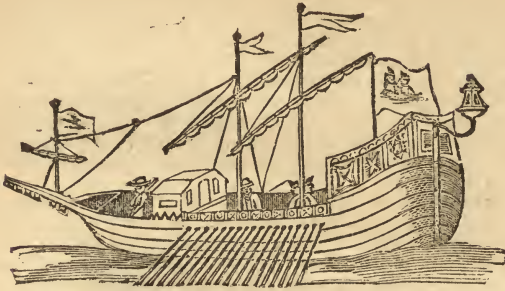
Galley, from the tomb of Fernando Columbus, at Seville.

however, is an invaluable document, entitled to great faith, and is the corner-stone of the history of the American Continent.