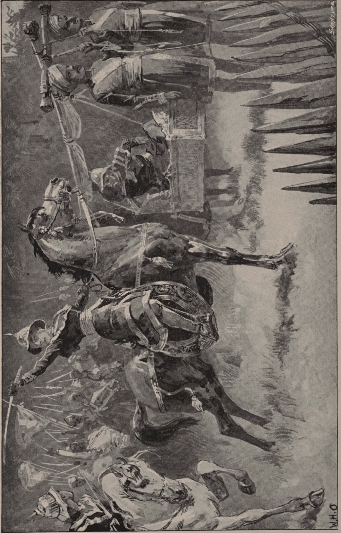
THE OLD BURMESE GENERAL WAS CARRIED FROM POINT TO POINT IN A LITTER.