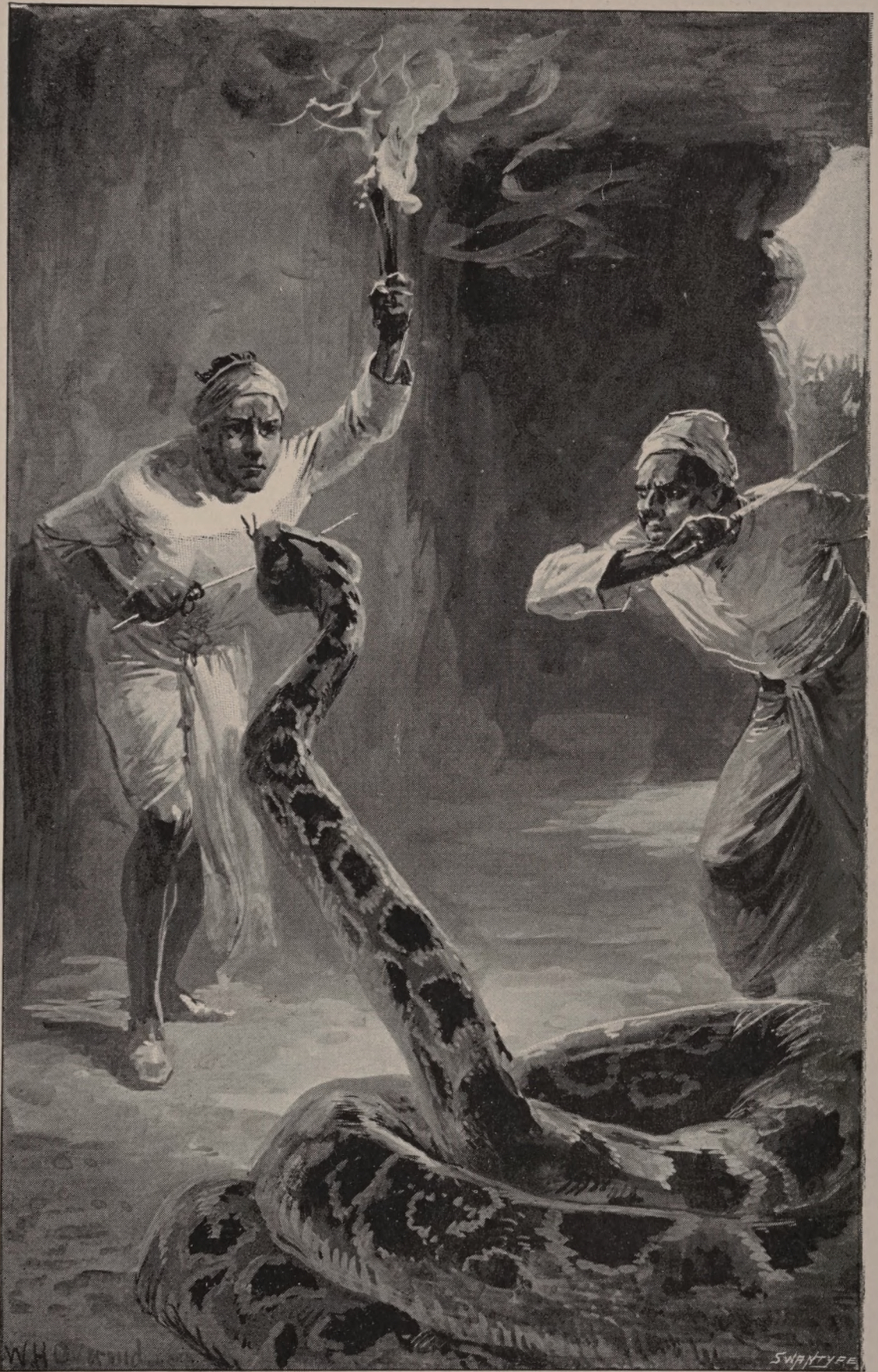
THE GREAT SNAKE MOVED HIS HEAD HIGHER AND HIGHER, HISSING ANGRILY.