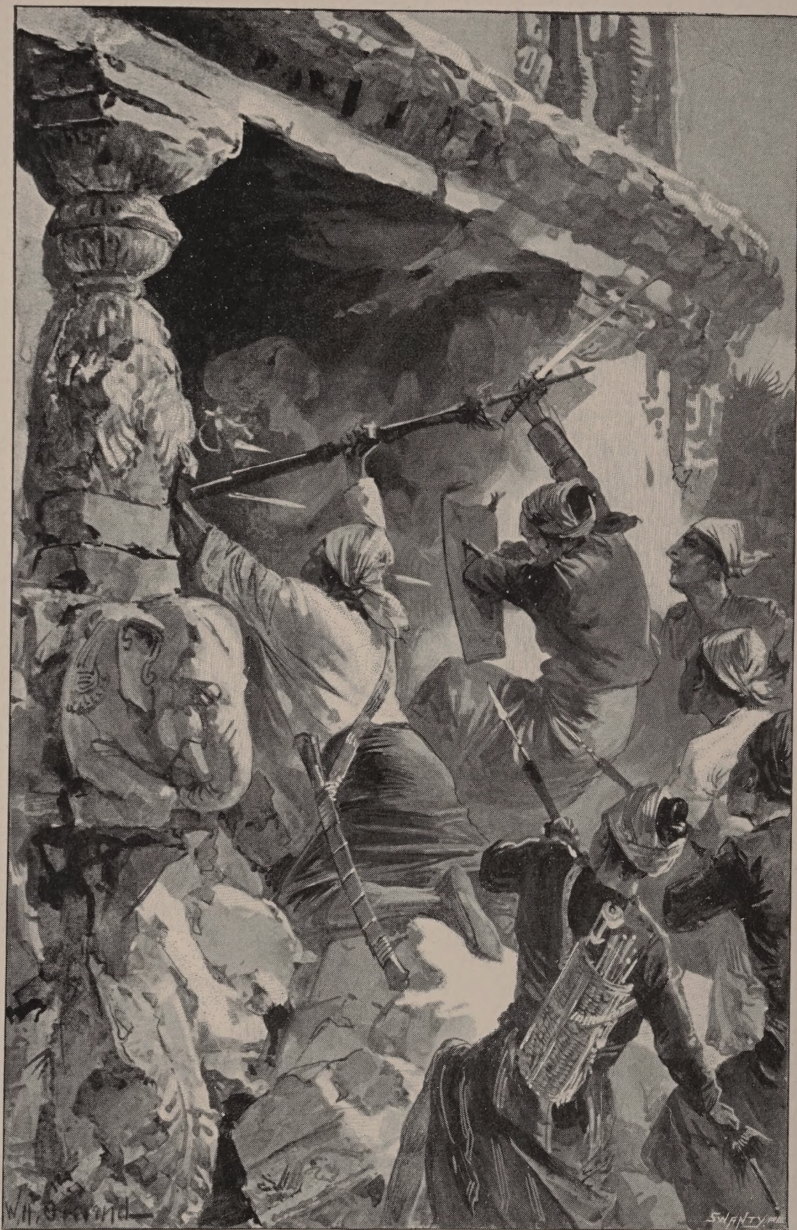
IN VAIN THE BURMESE TRIED TO FORCE THEIR WAY INTO THE CHAMBER.