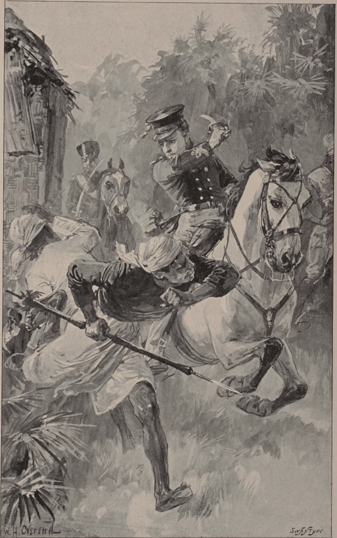
STANLEY CUT DOWN THE MAN WHO WAS ABOUT TO FIRE THE HUT.