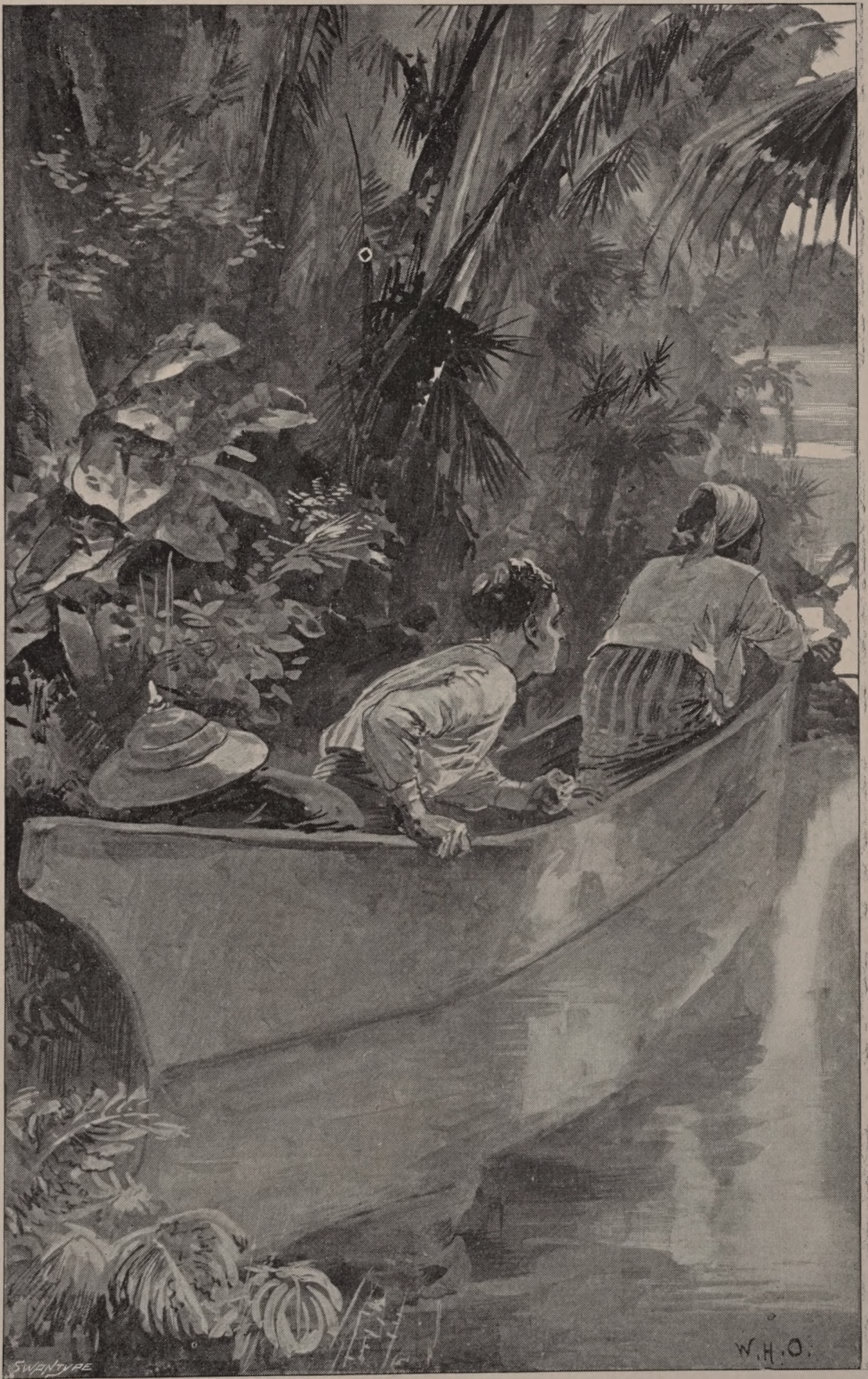
THEY FORCED THE CANOE BEHIND BUSHES SO AS TO BE ENTIRELY CONCEALED.