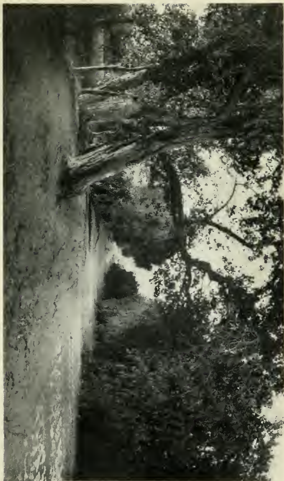
A SHADY LANE AT PALM SPRINGS