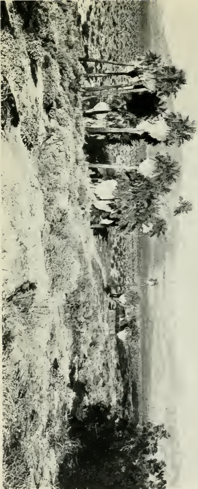
AT TWO-BUNCH PALMS: MT. SAN GORGONIO IN THE DISTANCE