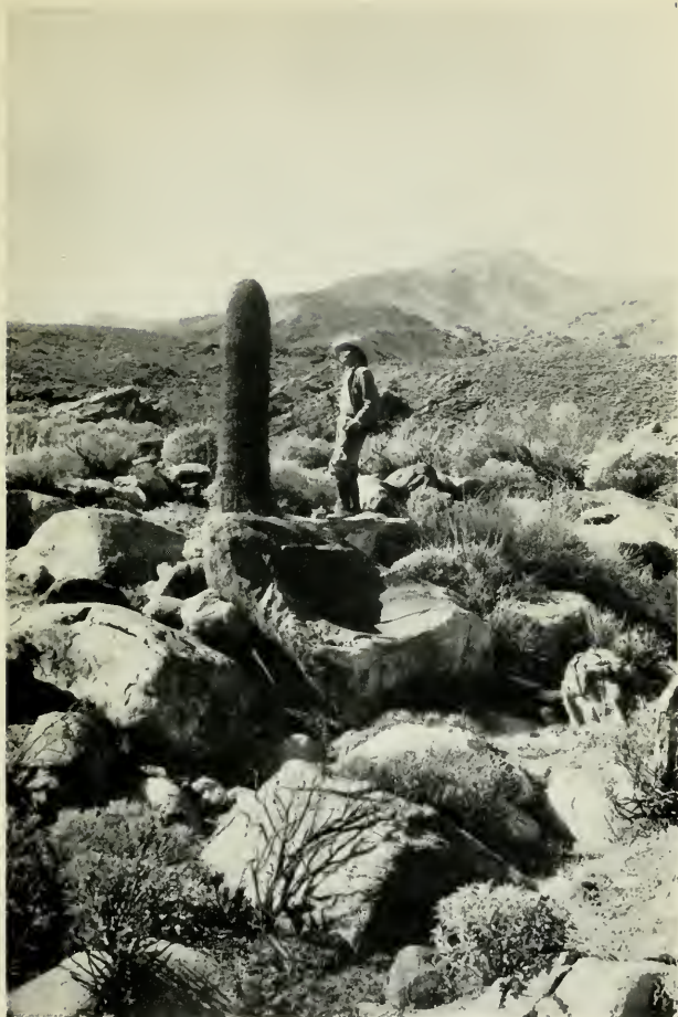
THE BIZNAGA, A STRANGE INHABITANT OF THE GARDEN OF THE SUN