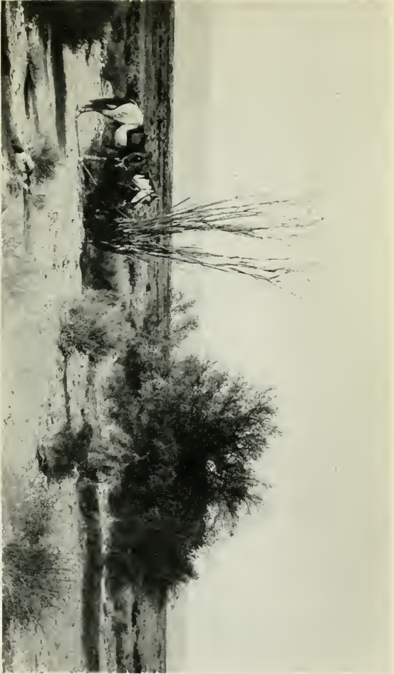
THE OCOTILLO AND PALO VERDE