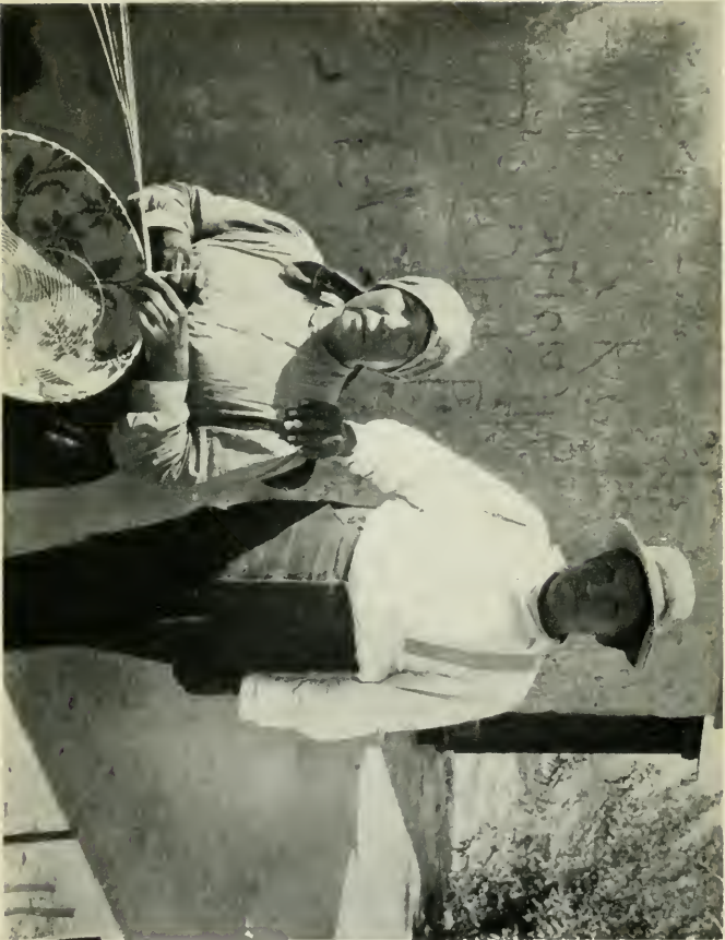
PALM SPRINGS INDIANS AT HOME