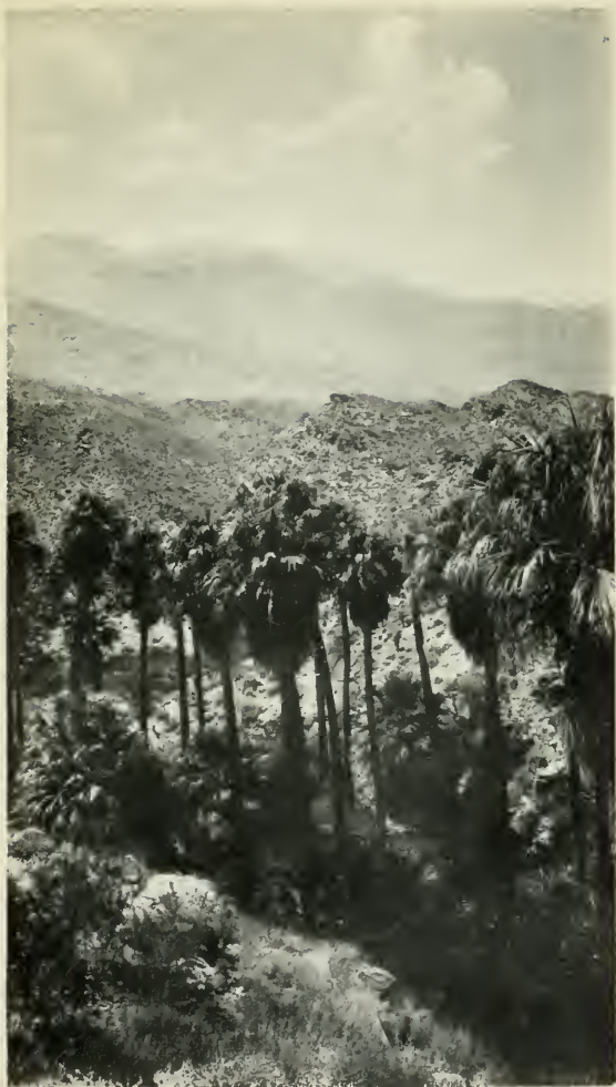
THE PALMS OF OUR ARABY