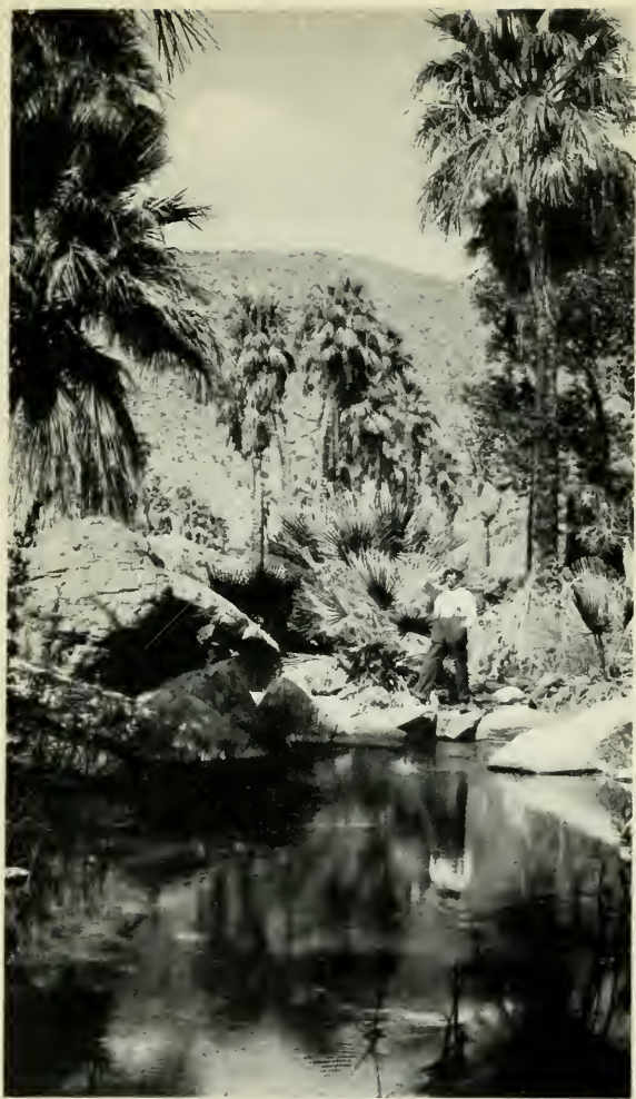
A PALM-LOVED POOL IN THE GARDEN OF THE SUN