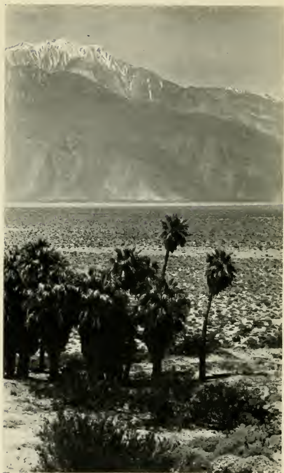
A VISTA IN OUR ARABY: MT. SAN JACINTO IN THE BACKGROUND