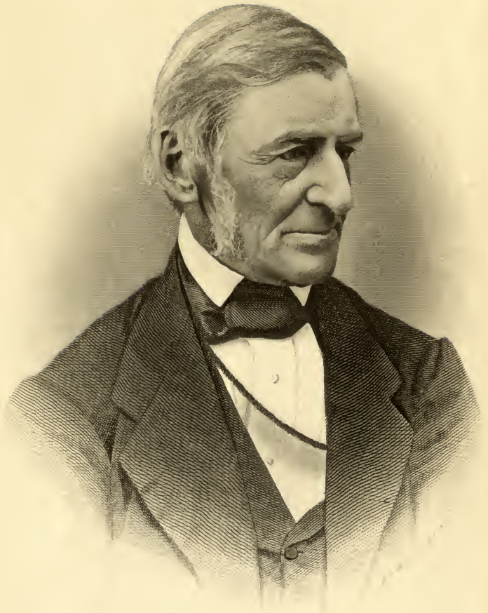
R. Waldo Emerson