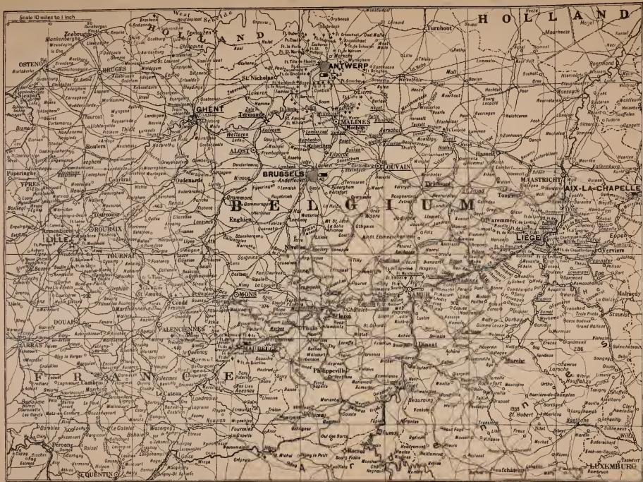
Taken from PHILLIPS' LARGE SCALE STRATEGICAL WAR MAP OF EUROPE (Western Area)