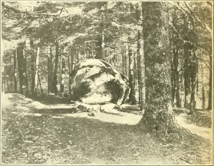
Glacial boulder in a forested mountain valley 700 feet above the sea.

The forests of Mount Desert Island were once full of wealth, and full of wealth they still would be if the lumbermen had not done their work so well. High up on the mountain sides, through the mountain gorges, along the borders of the lakes and streams, everywhere to the water's edge, the great trees growing on the thin but rich wood-soil were taken out, as one may plainly see by their huge rotting stumps to-day. The importance of preserving the woods which still remain no lover of Nature can question. They are infinitely precious as a part of the wild