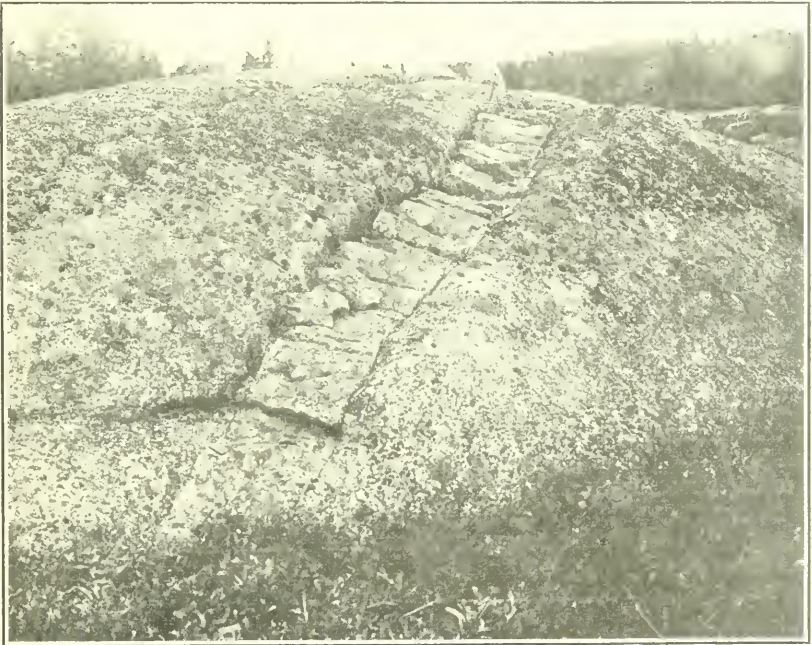
Pegmatite dike filling a rift in the granite of Pemetic Mountain.

Although the noble granitic rocks that form this range rest quiet and cold in their age to-day, they were once hot and energetic, pressing their way upward, as a vast molten mass, toward—and overflowing possibly—the ancient surface of the land. The massive granite stretches east and west across the island, inclosed wherever the attack of ice or sea has failed to lay it bare by rocks of a wholly different origin and character. At first these other rocks are seen as isolated fragments included in the granite; the fragments then become more frequent until