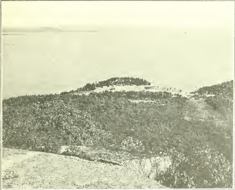
Schooner Head and the entrance to Frenchmans Bay seen from the summit of a splendid cliff. The sea horizon from this point lies over 30 miles away.

MOUNT Desert Island has an area of over one hundred square miles. The ocean surges against it on the south; broad bays enclose it on the east and west, and at its northernmost extremity a narrow passage only separates it from the mainland. Its outline is very irregular, like that of the Maine coast in general, with harbors and indentations everywhere. The largest of these, Somes Sound, a long, deep fiord running far into the land between mountainous shores, nearly bisects the island. There are some 13 mountains—bare rocky summits varying in