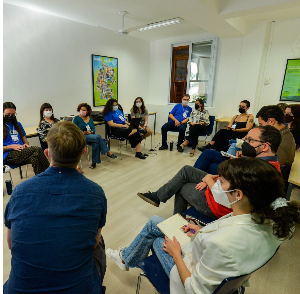
Conversation round at recent WikiCon Brasil about Movement Strategy in Brazil